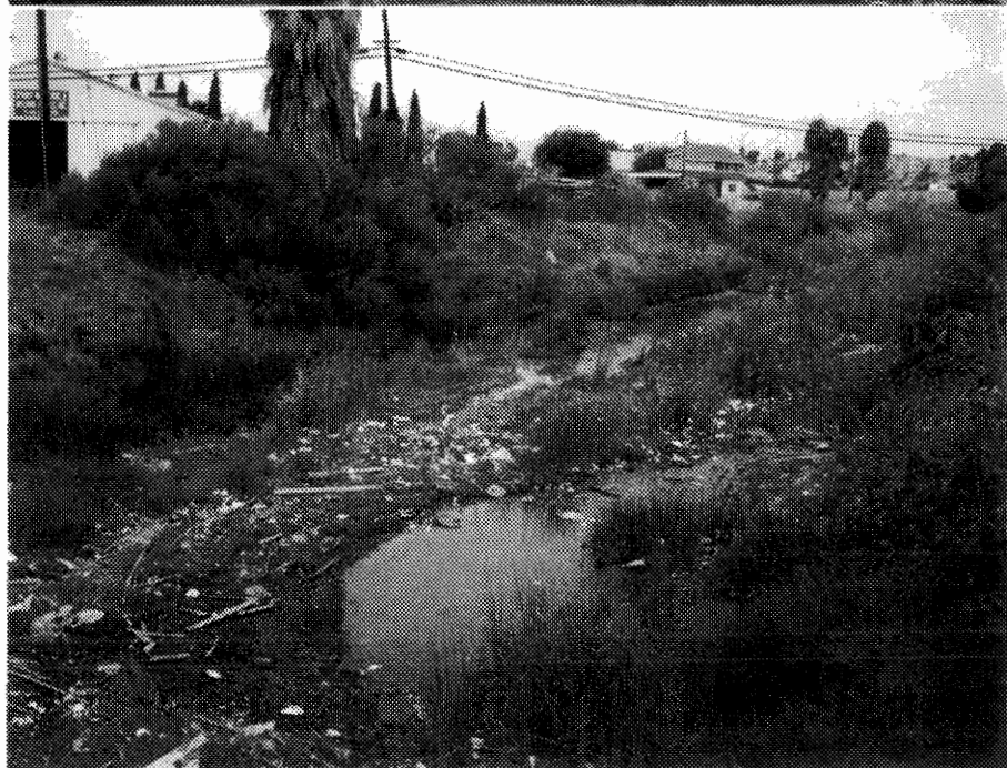
13. Chollas Creek upstream of National Ave.