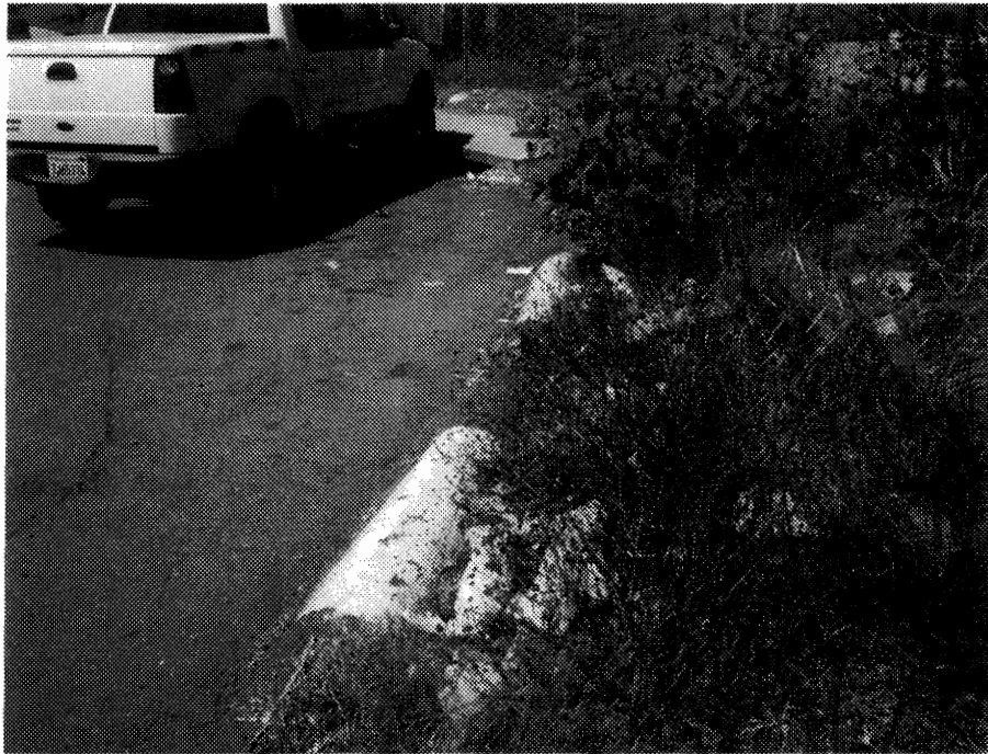
18. Trash adjacent to storm drain discharging directly to Chollas Creek near Euclid Ave./Altadena St.