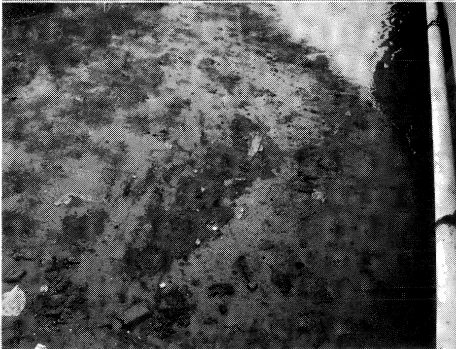
15. Chollas Creek at Harbor Drive.