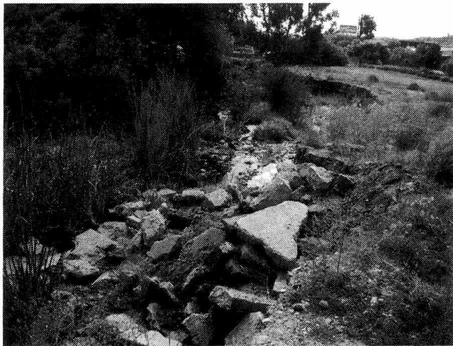
24. Illegal dumping of concrete waste in tributary to Chollas Creek at Federal Blvd./Central Ave.