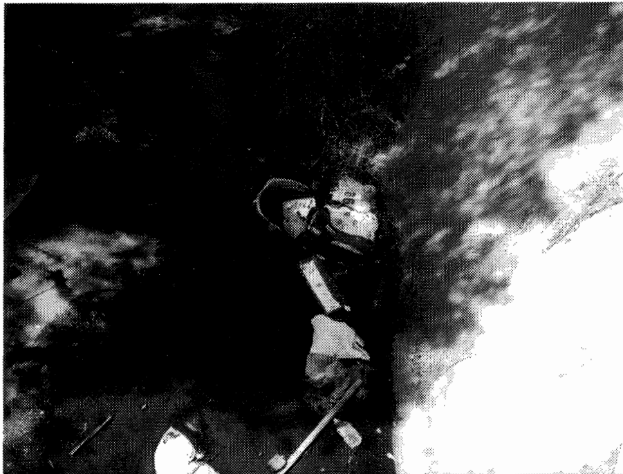
30. Paleta Creek downstream of Osborn St.