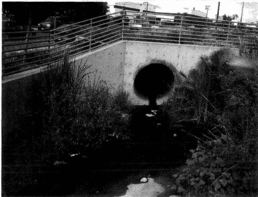
23. Tributary to Chollas Creek at Federal Blvd./Central Ave.