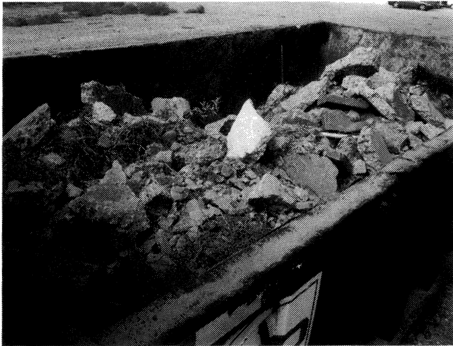
28. Concrete waste inside EDCO dumpster.