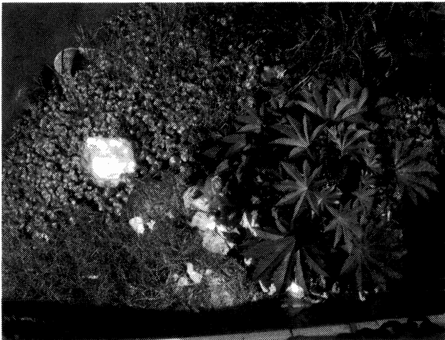
33. Paleta Creek upstream of Osborn Street.