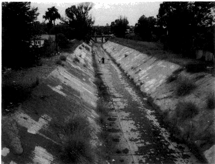
7. Chollas Creek upstream of Imperial Ave. REC-2?