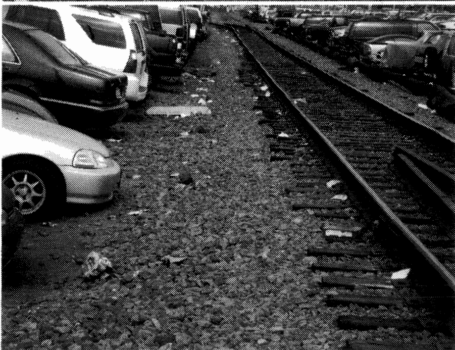
17. Trash in NASSCO parking lot near Chollas Creek at Harbor Drive.