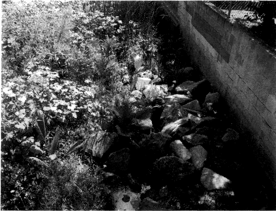
22. Tributary to Chollas Creek at Federal Blvd./Central Ave.