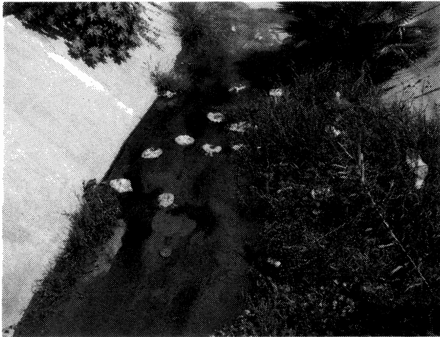
32. Paleta Creek upstream of Osborn Street.