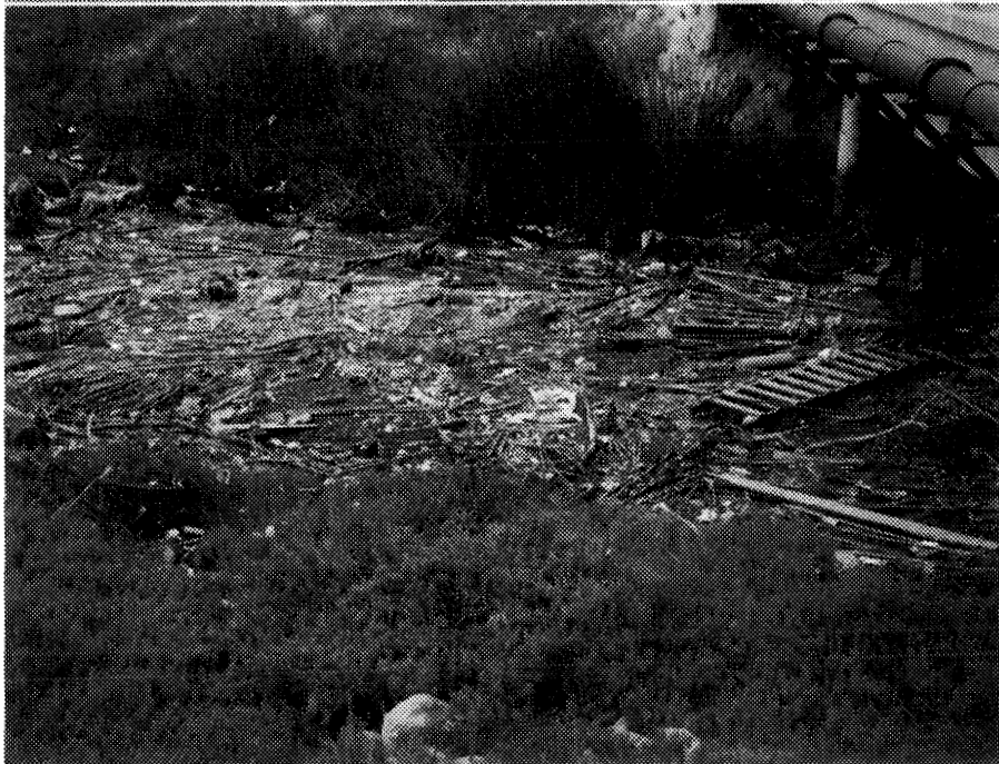
10. Chollas Creek downstream of National Ave.