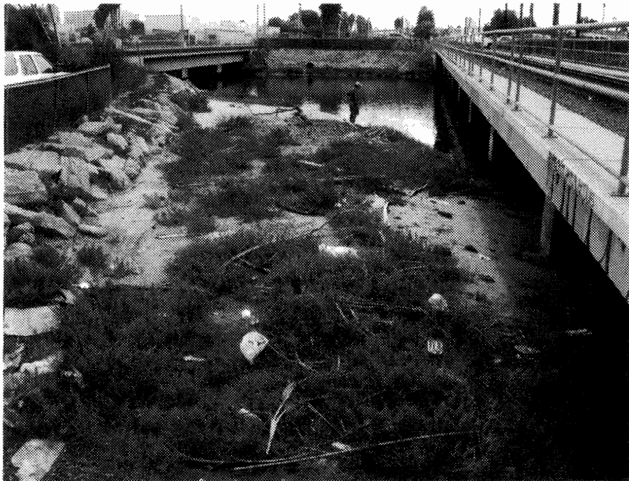
16. Chollas Creek at Harbor Drive.