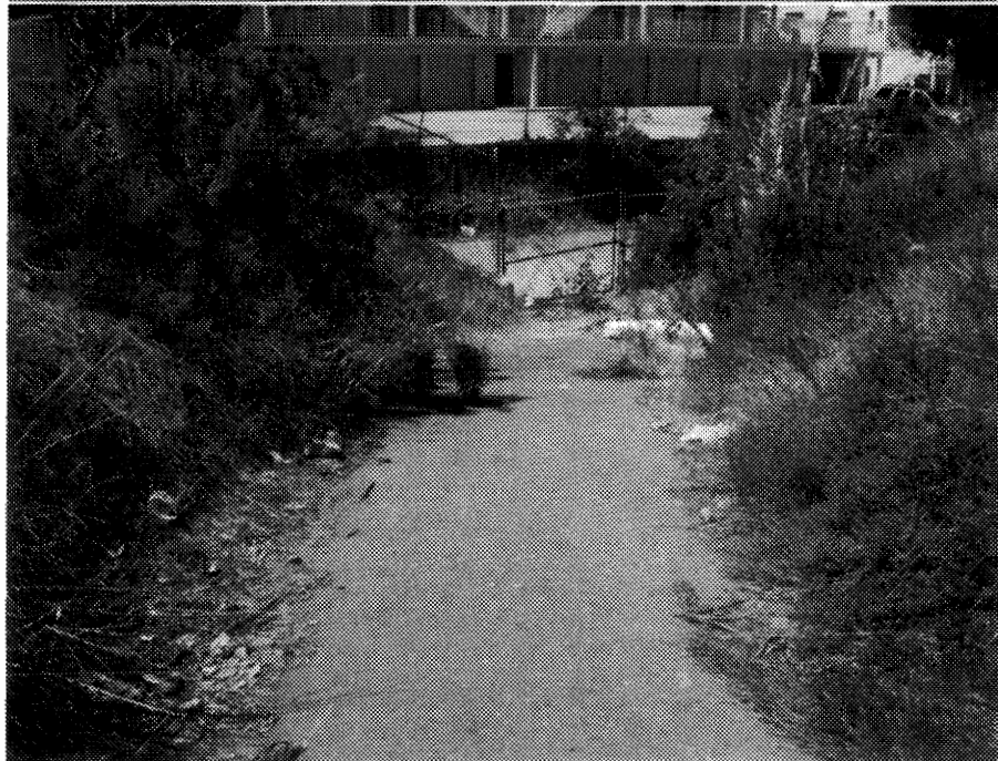
19. Access to Chollas Creek near Euclid Ave./Altadena St.