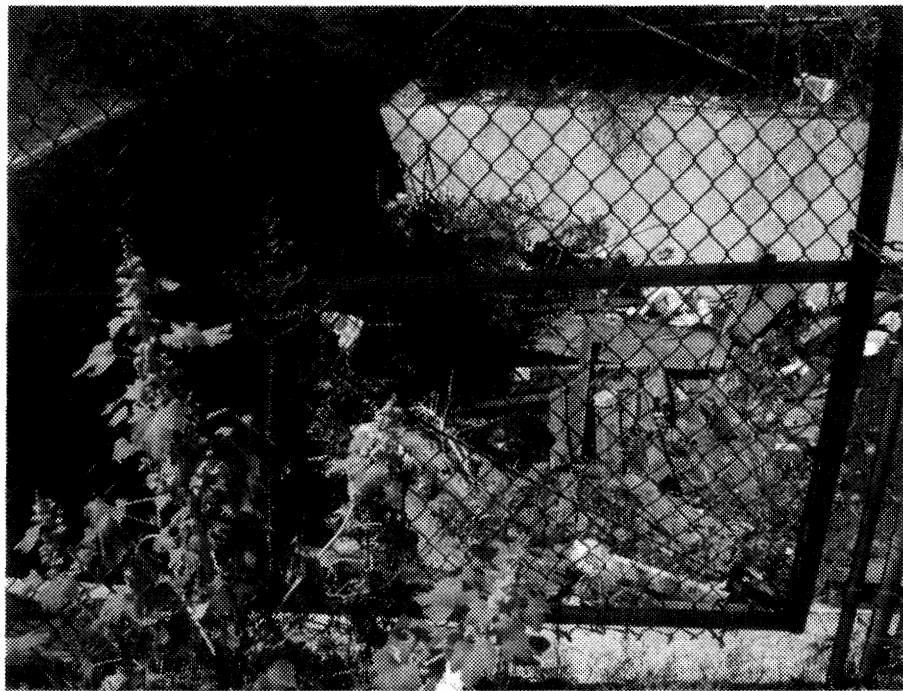
20. Evidence of illegal dumping in Chollas Creek near Euclid Ave./Altadena St.