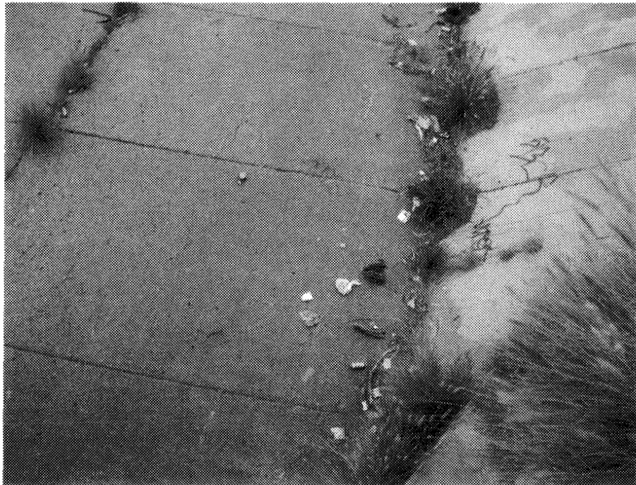
6. Chollas Creek downstream of Market Street.