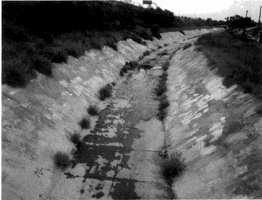
9. Chollas Creek downstream of Imperial Ave.