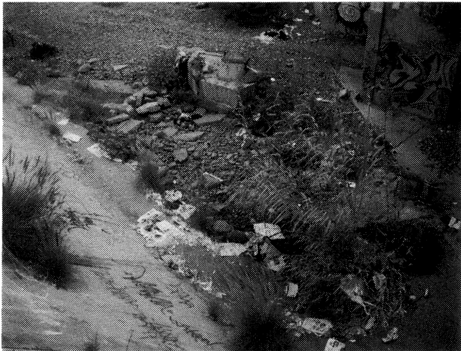
3. Chollas Creek upstream of Market Street.