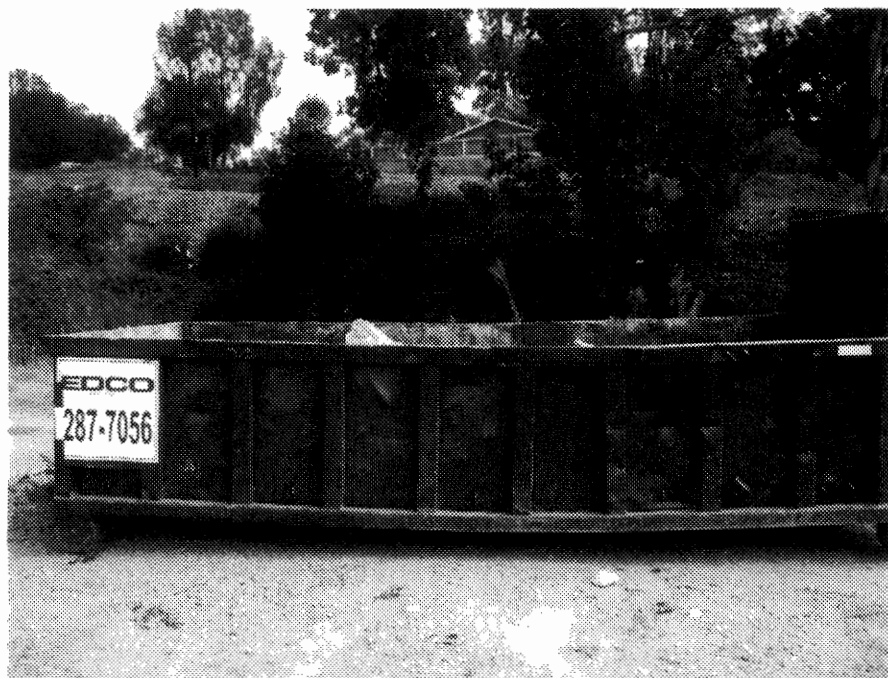
26. EDCO dumpster nearby illegal dumping of concrete waste.