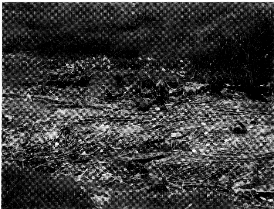
12. Chollas Creek downstream of National Ave.