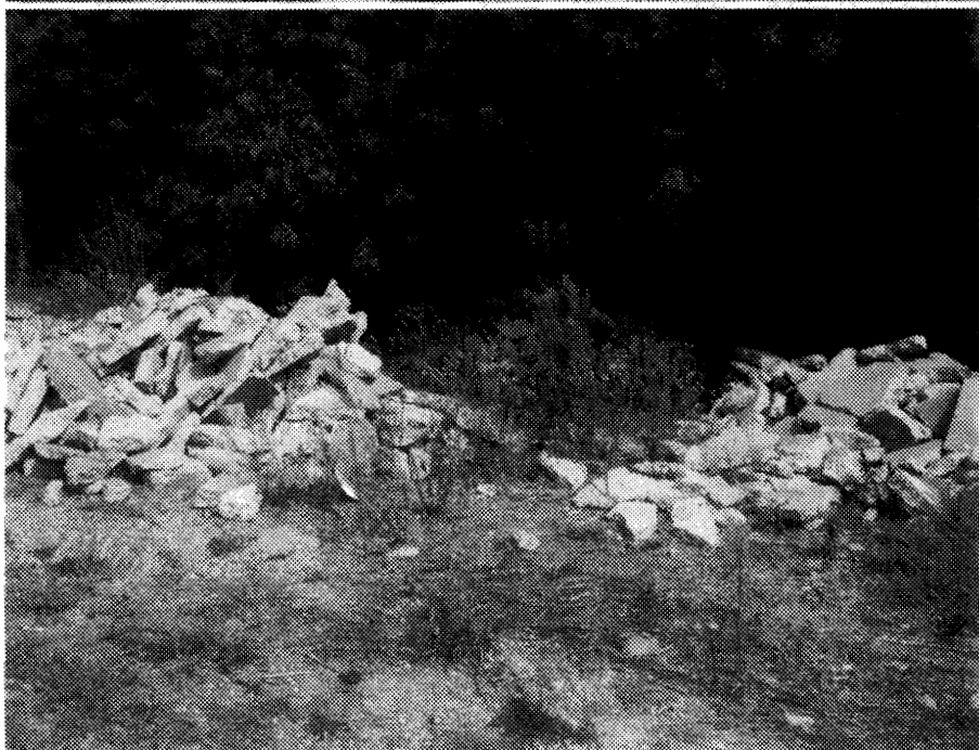
25. Illegal dumping of concrete waste adjacent to tributary to Chollas Creek at Federal Blvd./Central Ave.