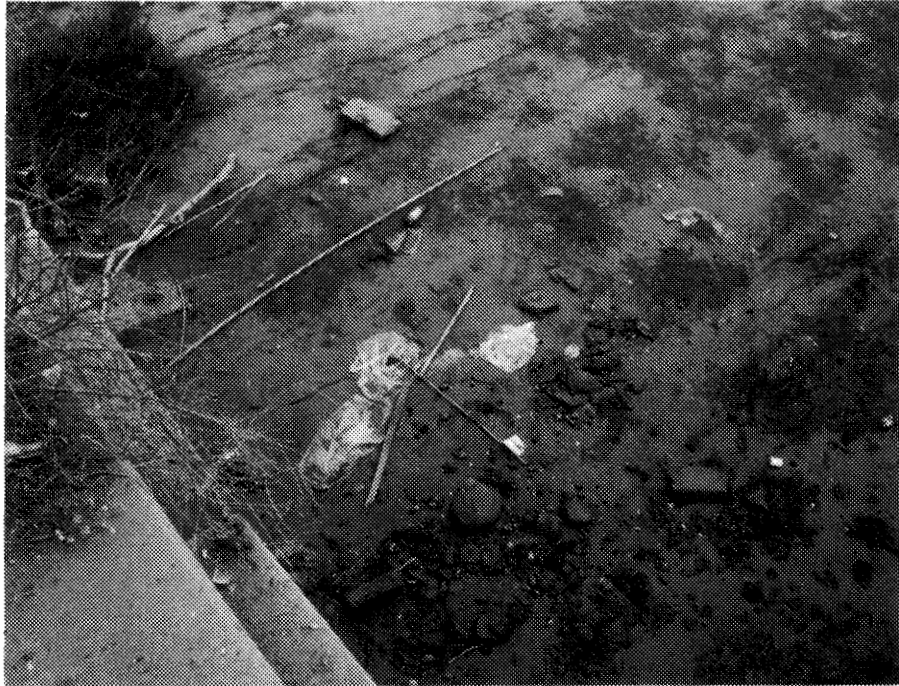
14. Chollas Creek at Harbor Drive.