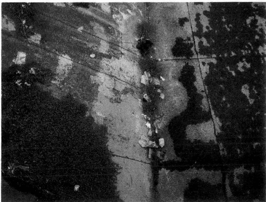
8. Chollas Creek upstream of Imperial Ave.