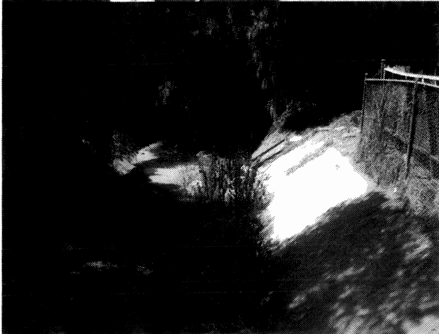
31. Paleta Creek downstream of Osborn St.