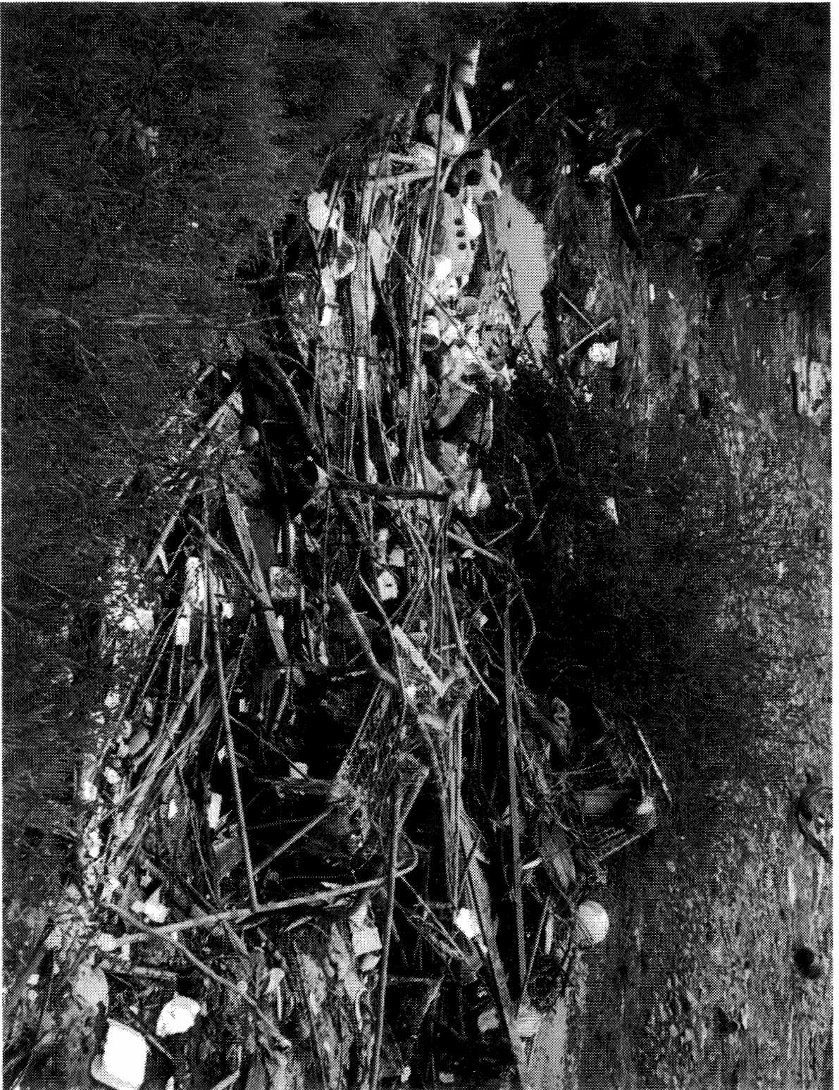
11. Chollas Creek downstream of National Ave.