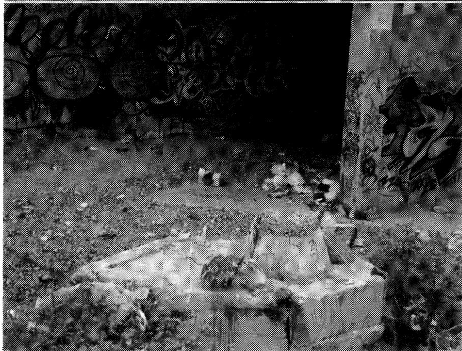
4. Chollas Creek upstream of Market Street.