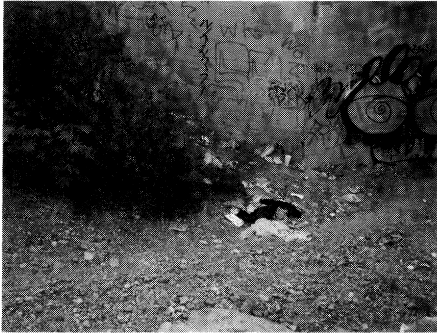
5. Chollas Creek upstream of Market Street.