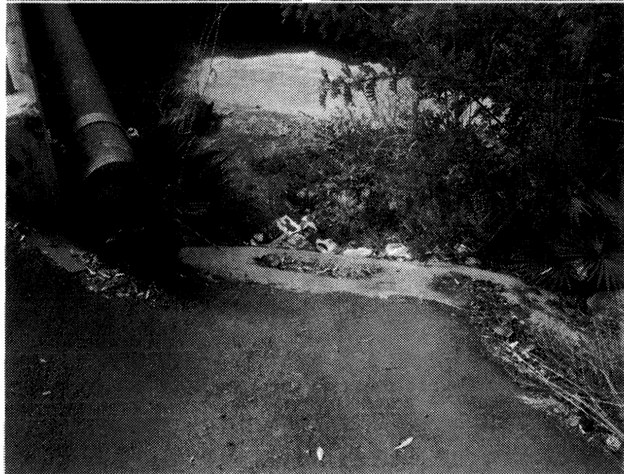
21. Tributary to Chollas Creek at Federal Blvd./Central Ave. Trash is at base of swale graded to drain Central Ave. into the creek.