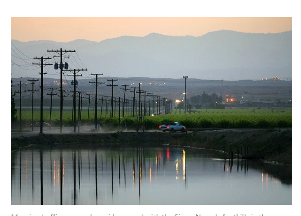
Morning traffic moves alongside a canal with the Sierra Nevada foothills in the distance near Bakersfield, California, in May 2008. Kern County Water Agency voted in support of the Delta tunnels project.

The auditor's report came shortly after Westlands Water District, in the powerful San Joaquin Valley agricultural region, ducked out of the deal as its board of directors decided WaterFix would not be worth paying for. It also came in the wake of a report from the Interior Department revealing that the U.S. Bureau of Reclamation had quietly billed the country's taxpayers for $50 million in planning costs. For years, it has been understood that participating water agencies, not taxpayers, will fund the project. Westlands, which ostensibly should have paid most of the sum in question, has not indicated it will reimburse the public.