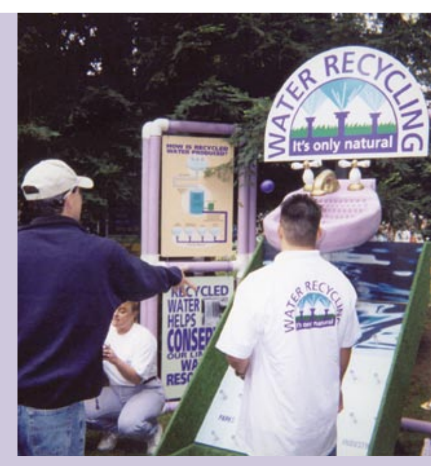
SRCSD won two Gold "Cappie" Awards from the Sacramento Public Relations Association for both its overall water recycling public relations program and for its water recycling booth (above).

Focus groups and a community advisory committee (consisting of public officials, community and industry leaders, commercial, industrial and residential users of recycled water and county staff) were instrumental in developing public education materials, including brochures, community event exhibits, fact sheets and a school education program. Additional outreach was conducted through customer mailings, a billboard advertising campaign and 13 articles in the Sacramento Bee, Sacramento Business Journal and the Elk Grove Citizen. The grassroots approach led to a successful outcome to recycled water use in Elk Grove.