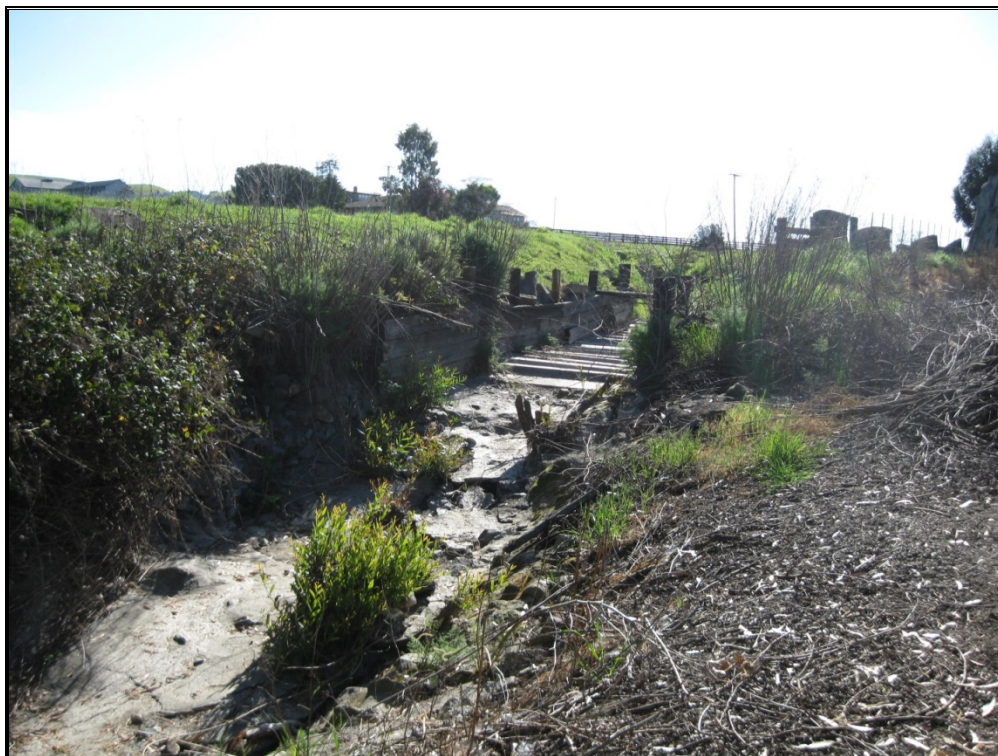
Photo 3 – Secondary spill channel around reservoir D032167 (inlet to Reservoir ID 543)