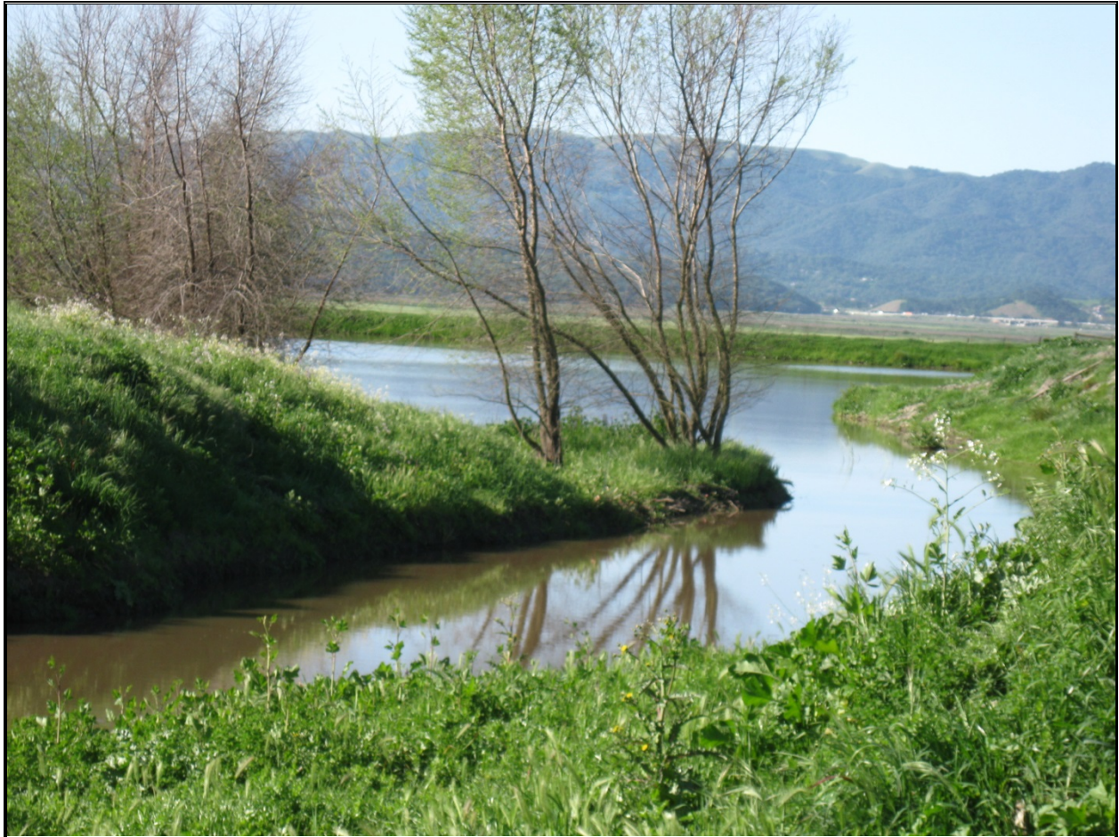
Photo 1 - Reservoir ID 543 – Southwest view from Old Lakeville Highway (photo taken 3-18-15)

difference in two reported reservoir depths. In contrast to the 12 foot depth reported to Division staff by the owner during the 2011 inspection, Kelder engineering measured a maximum reservoir depth of 8.4 feet. The 15.25 acre-foot discrepancy in reservoir capacity is likely accounted for by the difference in the depth reported to the top of the spillway weir gate (by the owner), and the measured depth to the spillway invert (reported by Kelder Engineering).