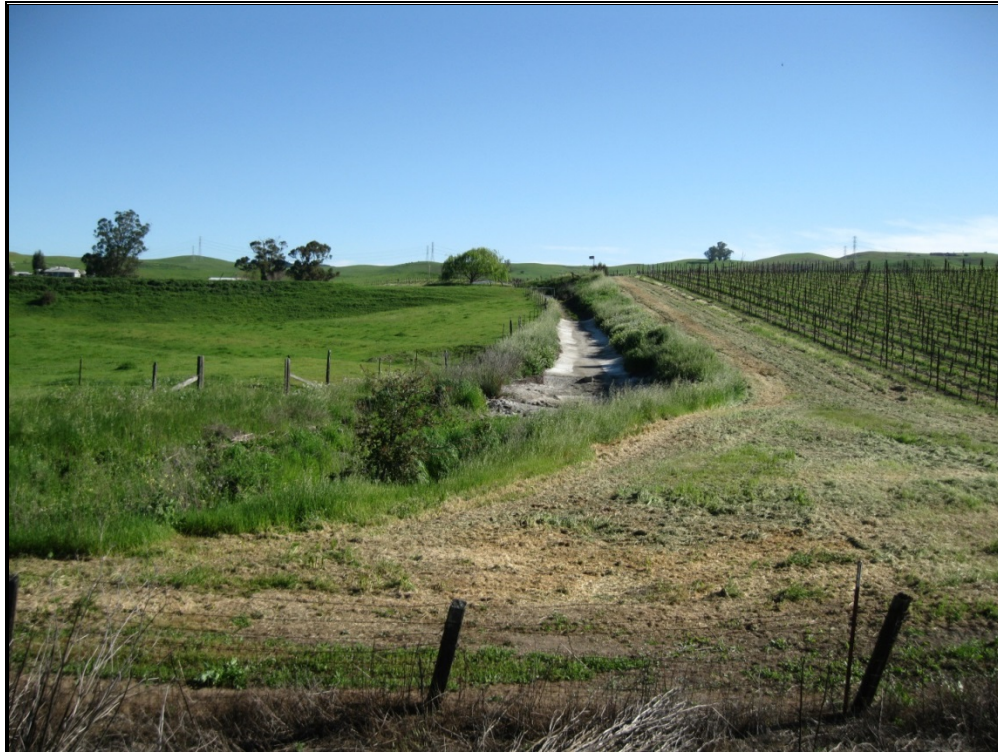
Photo 4 - Reservoir ID 543 Northeast view of dam, spillway and vineyard from Lakeville Hwy. Reservoir is not spilling (photo taken 3-18-15)