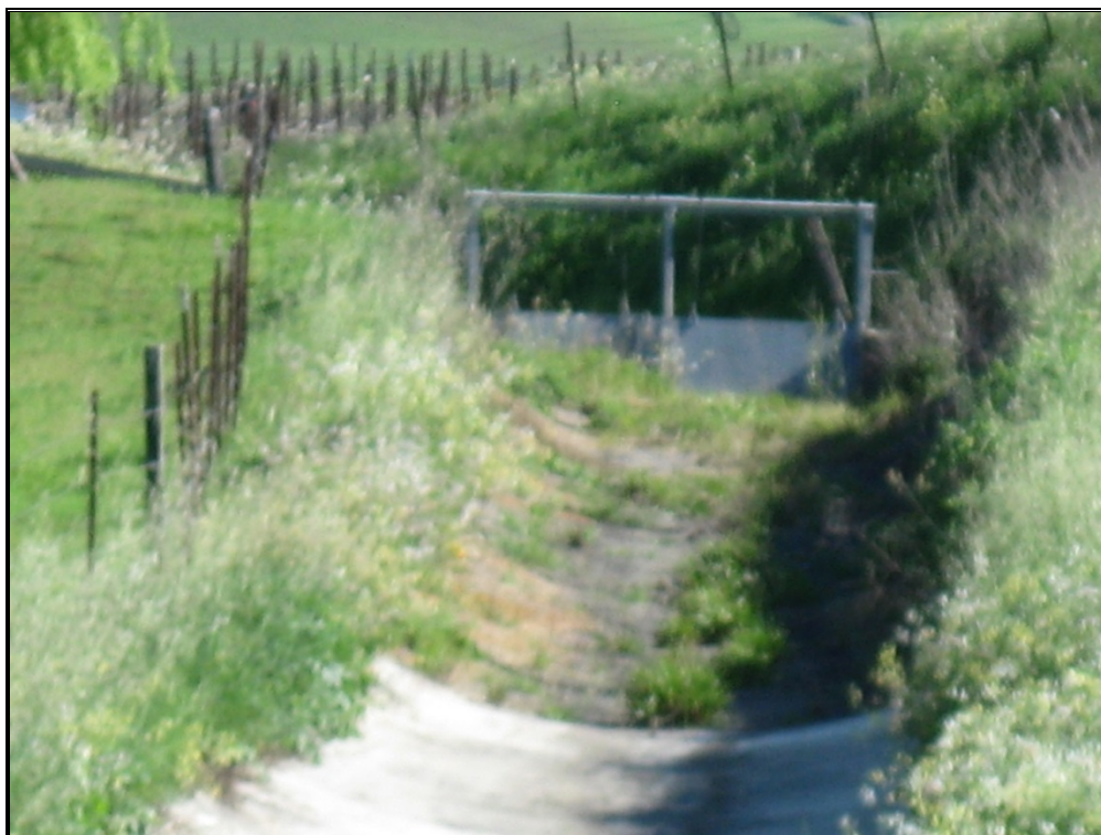
Photo 5 - Reservoir ID 543 Spillway weir gate (photo taken 3-18-15)