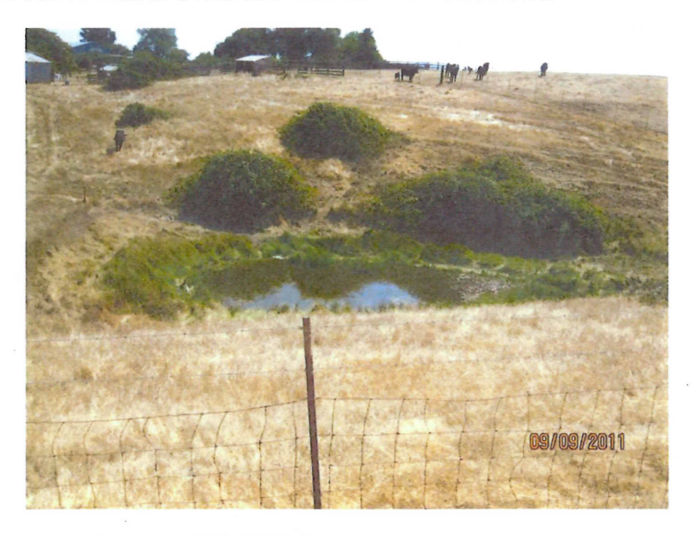
6. LOOKING EAST AT THE SPRING.