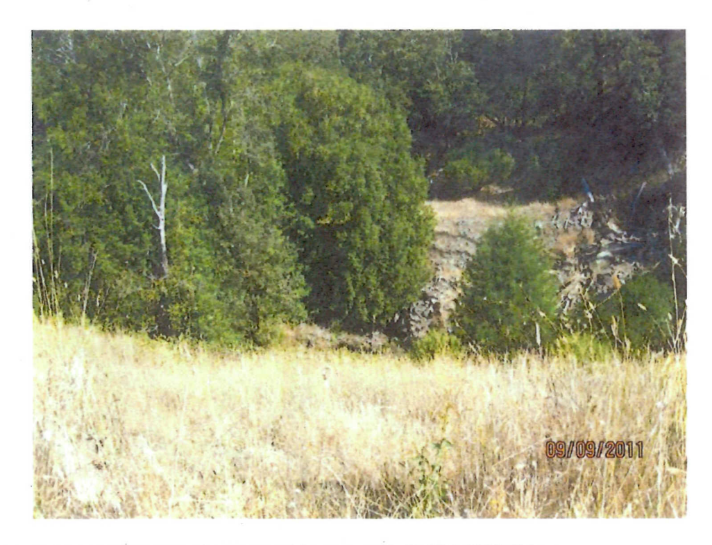
5. LOOKING NORTH OVER THE DAM AND DOWNSTREAM.