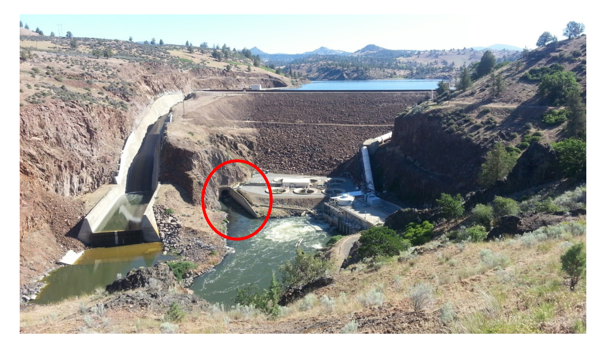
Figure 2: Low Level Outlet Discharge into Klamath River at Base of Iron Gate Dam