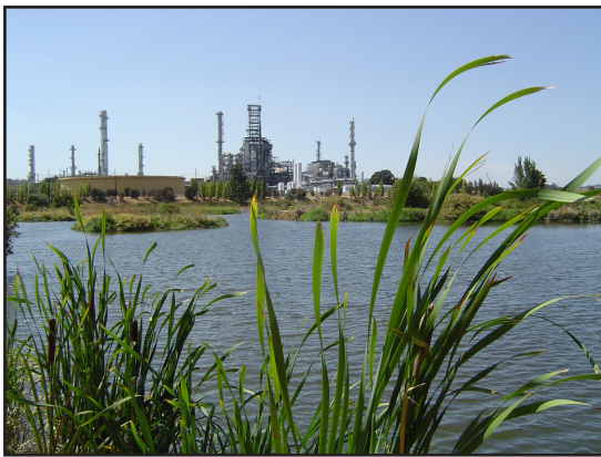
Mountain View Sanitation District Flushing Ponds (Treated Wastewater)

The Water Boards released its first Web-based Performance Report in September 2009. To improve transparency and accountability, a key priority for the Water Boards, the Performance Report is designed to provide information on the Water Boards' efforts to protect and allocate the state's waters for beneficial uses.