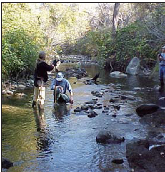
North Coast Regional Water Board staff monitoring water quality.

The Water Boards enforce pollution control requirements that are established for discharges. Where violations of regulatory requirements are detected, enforcement actions of varying types and severity are taken. For the most serious violations, penalties are often imposed. In all cases, the goal of enforcement is to encourage compliance with requirements so that water quality is protected. This part of the Performance Report presents data and information on violations, enforcement actions, and penalties.