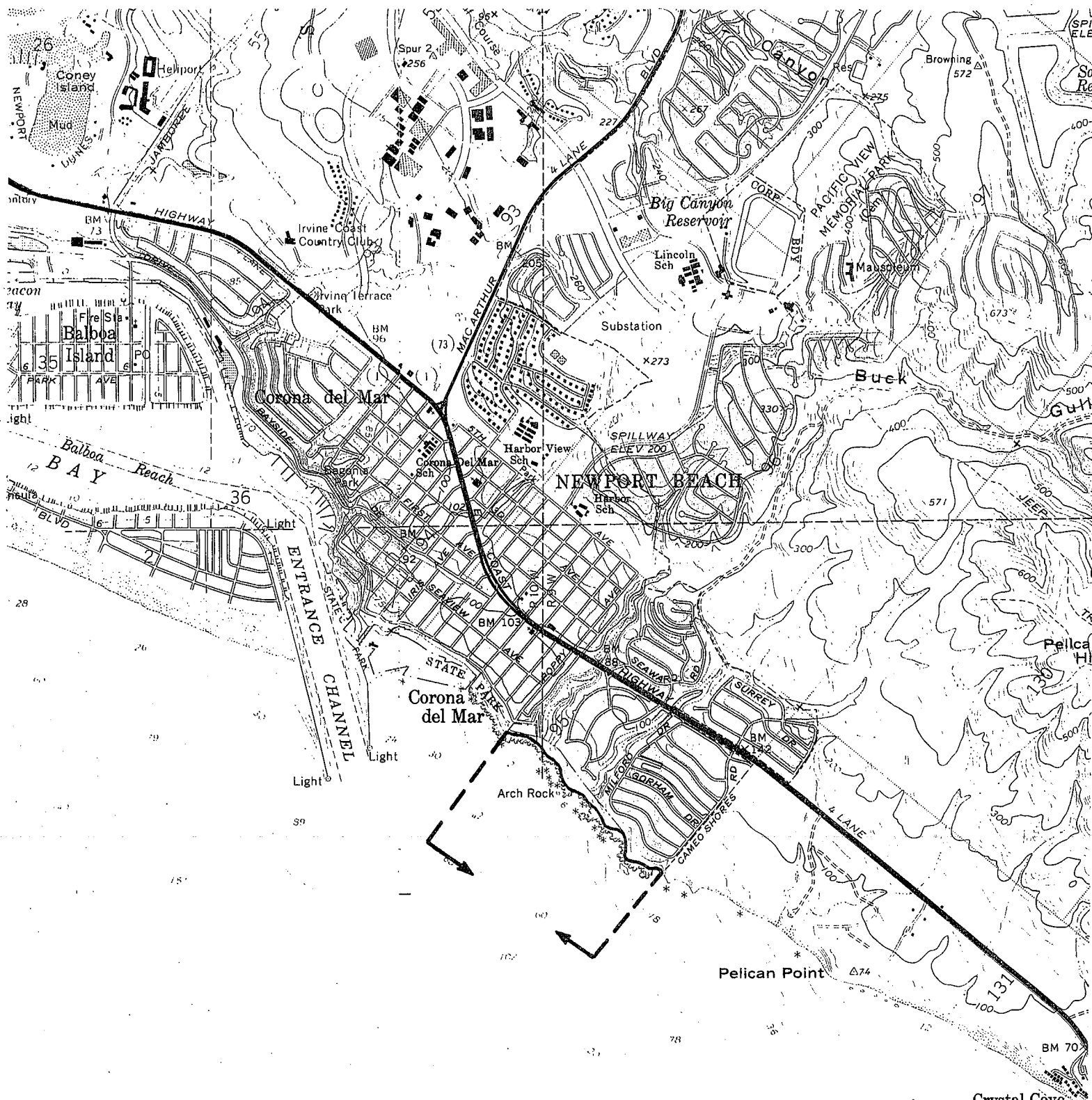
Figure 1 NEWPORT BEACH MARINE LIFE REFUGE AREA OF SPECIAL BIOLOGICAL SIGNIFICANCE Ref. Map: USGS Laguna Beach, CA Scale: 2.5 inches = 1 mile Seaward boundary is 1,000 feet from shore or to the 100-foot isobath, whichever is more distant