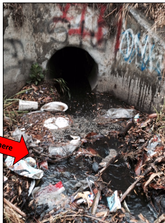
Figure 3. Stormwater runoff containing food and beverage containers in the Tijuana River watershed.