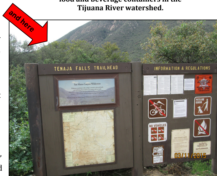
Figure 4. An open space area in the San Mateo Creek watershed with high levels of recreational use where caffeine was detected.

For more information, please see Busse and Nagoda, 2015