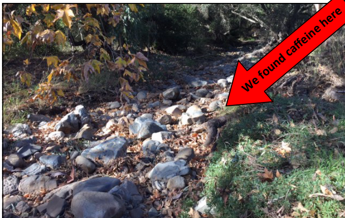
Figure 2. Stream system located in the Carlsbad watershed near septic systems where caffeine was detected.

Patterns of detection and concentrations suggest that caffeine sources within developed areas include leaky sewer lines, poorly maintained septic systems, food waste or beverage containers from trash receptacles or littering, recycled water used for irrigation, and stormwater runoff (Figures 2 & 3).