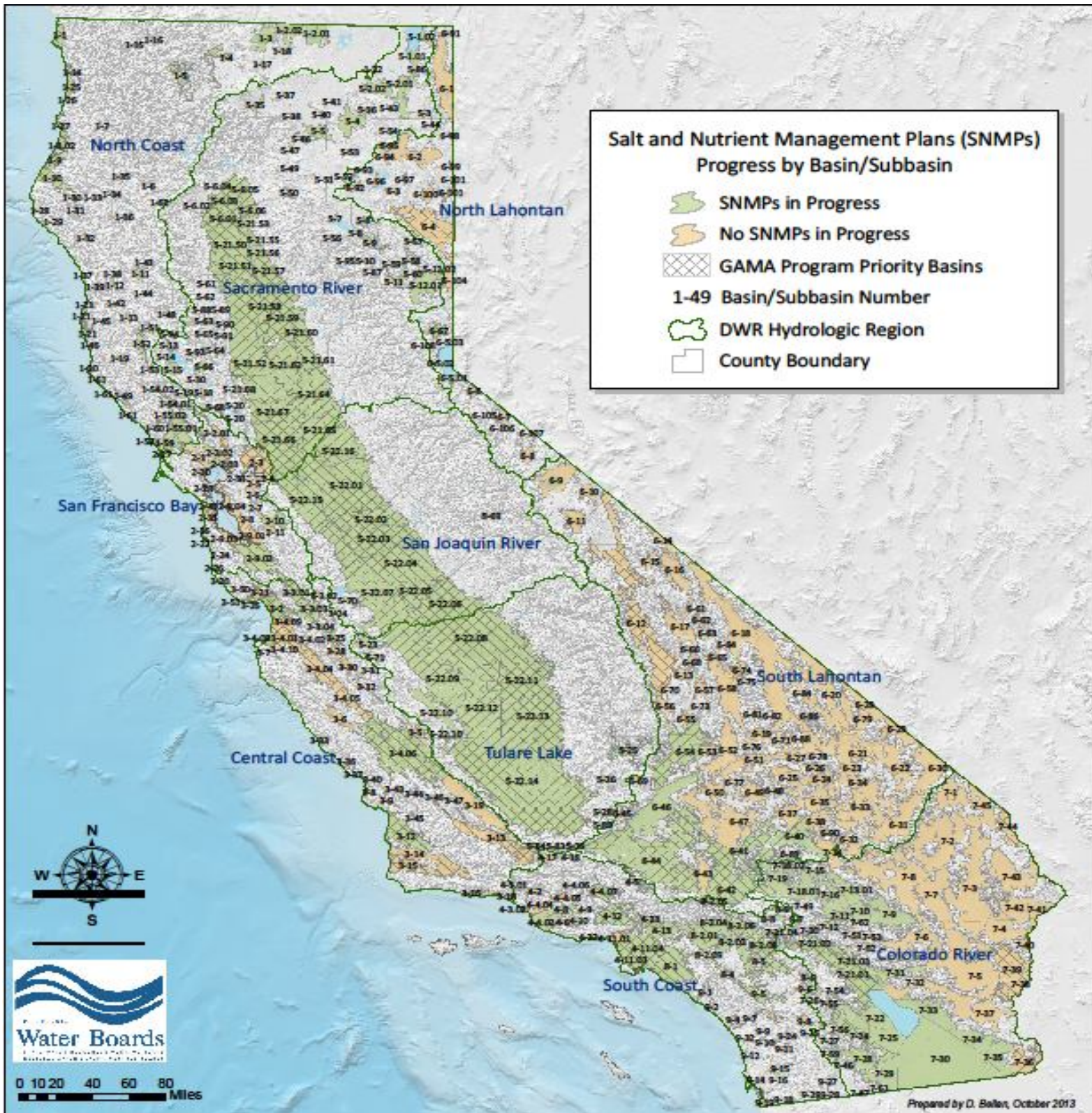
Figure 1. Salt and Nutrient Management Plan Progress in California Groundwater Basins

planning group participants, DWR grants for integrated regional water management, and the State Water Board cleanup and abatement fund. A summary of SNMP progress is shown in Table 1.