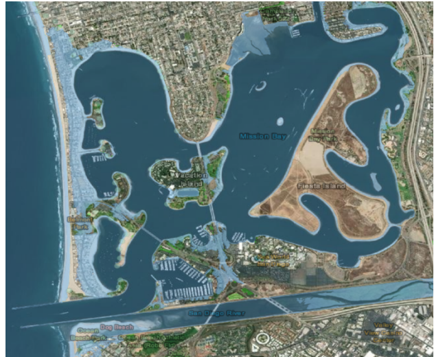
Figure 1. Areas of Mission Bay that are likely to flood with 3 feet of sea level rise during a 20-year storm event.

Sea level rise projections for the San Diego Region range from 2.5 to 10 feet by the year 2100 and could cause significant environmental and economic impacts. 13 For example, in Mission Bay, San Diego is poised to lose hundreds of millions of dollars of property and infrastructure as nearly all of Mission Beach and most of the shoreline around Mission Bay would be under water during a typical storm (Figure 1). The impacts and losses would be even more severe during a catastrophic once in a century storm.