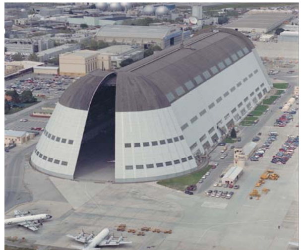
Hangar 1, view of south clamshell doors.

Based on community concerns, including a desire to preserve the hangar for its historic nature and future use, in 2008 the Navy re-evaluated removal options and selected a different alternative. The new alternative includes removal of the siding and sealing of the steel frame with an epoxy coating. The Navy plans to implement this alternative this summer and anticipates it will take one year to complete. The Navy does not plan to re-side the hangar. However, the Navy and NASA (the current owner of the hangar) are discussing which agency will take responsibility for re-siding the hangar.