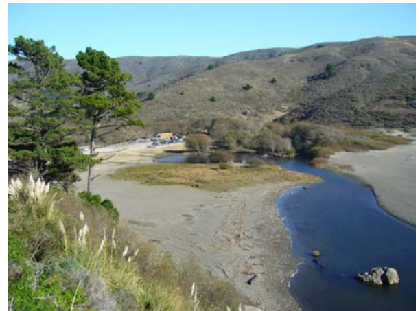
Lagoon and wetland area between lagoon and the parking lot, facing E-NE and looking upstream from Pacific Way on the hill near the mouth of the creek. The photo on the right shows the new 0.4-acre lagoon expansion, which is a backwater to the existing creek alignment. In the lower left side of the photo on the right, the bright green kikuyu grass has been removed from the sandy area. The kikuyu grass was scraped out to rooting depth and screened, then the sand was replaced. The remaining vegetation between the new lagoon expansion and the cleared sand is native wetland vegetation.