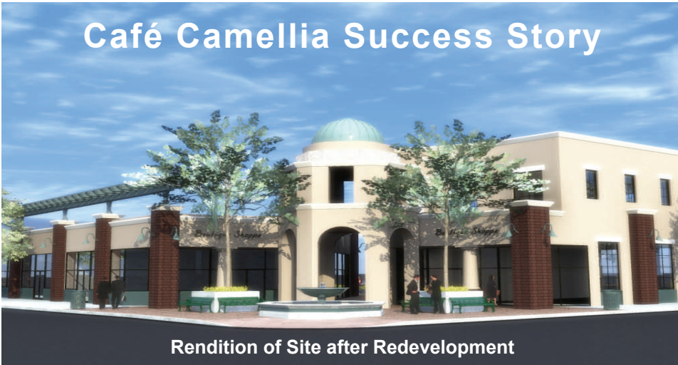
Rendition of Site after Redevelopment

EPA's Targeted Brownfields Assessment Program conducted an investigation at the site, enabling the Café Camellia redevelopment project to move forward as a cornerstone of the City's Downtown Bellflower Revitalization Vision Strategy.