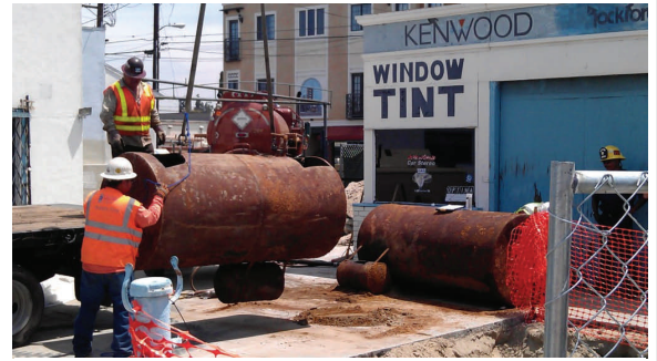
Café Camellia during UST Removal