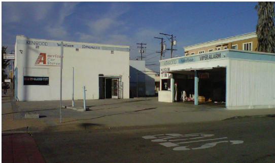
Café Camellia before Field Activities

and the Los Angeles Regional Water Quality Control Board to conduct a field investigation, involving removal of the three USTs. The field work enabled the redevelopment project to move forward as a cornerstone of the City's Downtown Bellflower Revitalization Vision Strategy, for which the City of Bellflower received the "Neighborhood Planning Award" from the American Planning Association (APA), California Chapter, in 2012.