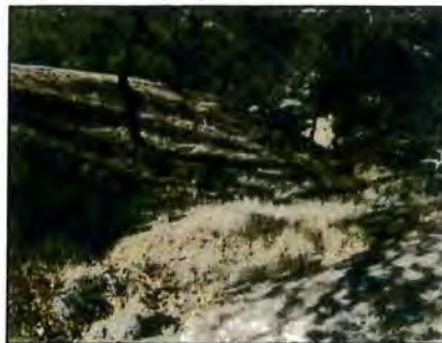
Figure 4: Defined channel as seen looking west from the cattle crossing in Figure 3.