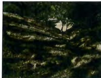
Figure 5: Defined channel as seen looking west downstream of Figure 4.