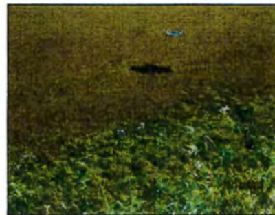
Figure 33: Close up of the reservoir surface cover. Rock hole in the upper portion of the photo.