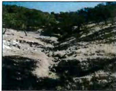
Figure 2: Defined channel as seen looking east.