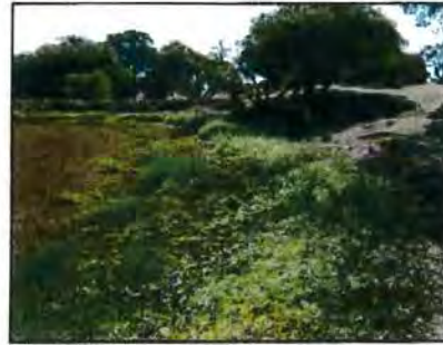
Figure 35: Western side of the reservoir as seen looking south.