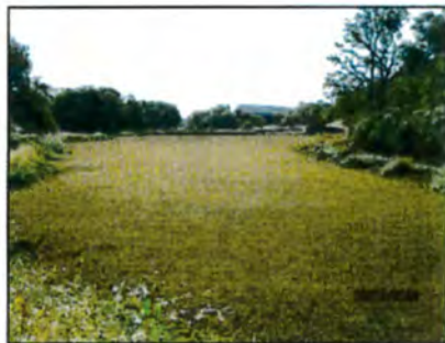
Figure 32: Reservoir as seen looking south from the northeastern bank of the reservoir.