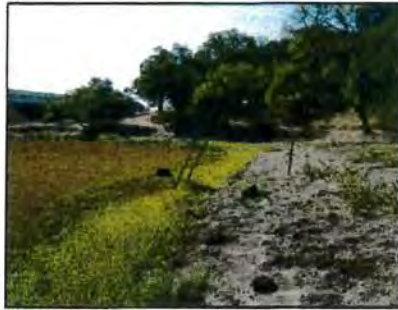
Figure 34: Western side of the reservoir as seen looking south.