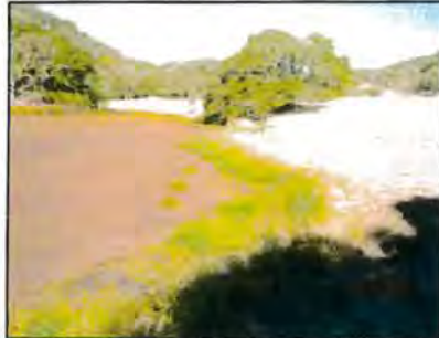
Figure 37: Eastern bank of the reservoir looking northwest as seen from spillway.