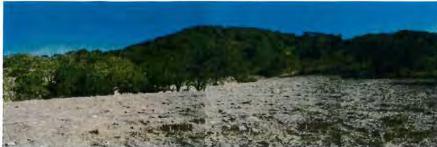
Figure 1: Defined channel above the reservoir tributary to the Unnamed Stream as seen from the pasture on the northeastern side of the reservoir.