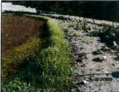
Figure 36: Southern point of the reservoir looking northeast along the dam.