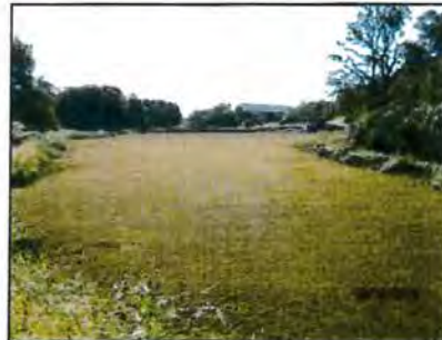
Figure 39: From the northeasterly bank looking south across the reservoir.