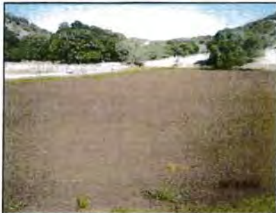
Figure 38: From the spillway looking northwest across the reservoir. It appears the grassy vegetation in the foreground is growing on top of the reservoir surface cover.