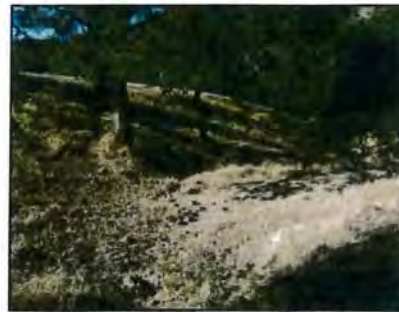
Figure 3: Defined channel as seen looking west towards the Unnamed Stream. Signs of cattle crossing seen on both sides of the channel.