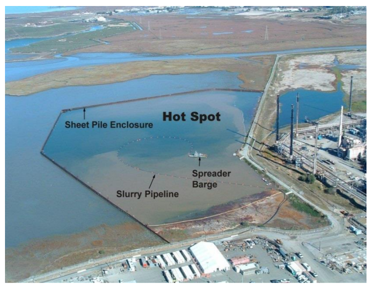
Castro Cove Remediation, November 2010