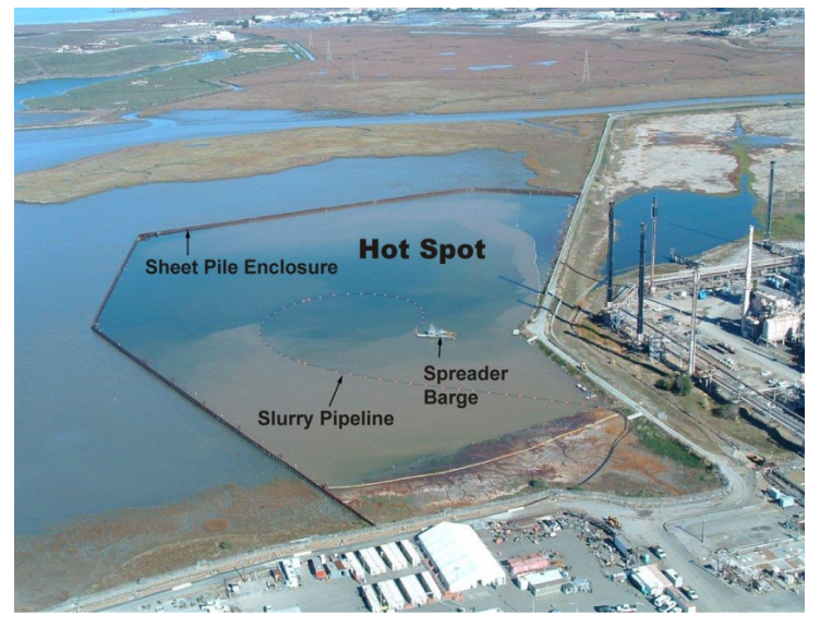
Castro Cove Remediation, November 2010