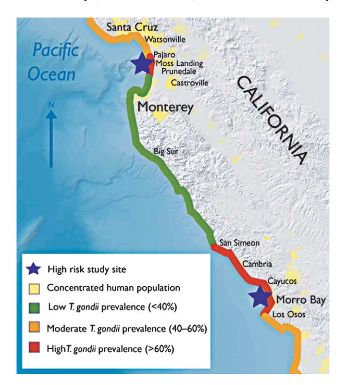
Fig. 2. California range of the southern sea otter illustrating coastal areas of low, moderate and high seroprevalence of Toxoplasma gondii in live and dead sea otters surveyed 1998–2004.

Because otter captures, strandings and age classes were not distributed evenly along the coast, geographic differences were evaluated by multivariate logistic regression so that findings could be adjusted by age and live/dead status. Significant differences in risk of exposure to this pathogen in live and dead otters among different areas within the sea otter range are evident. Otters from the Elkhorn Slough/Moss Landing area (in the centre of Monterey Bay) and otters from Morro Bay had the highest levels of exposure to T. gondii (Fig. 2). Specifically, otters from the Elkhorn Slough area were six times as likely (95% Confidence Interval (CI): 1.9-20.0) and otters from San Simeon to Morro Bay were five times as likely (95% CI: 1.9-16.2) to have been exposed to T. gondii than otters from the more remote and rocky Big Sur coast. Otters from the northern half of Monterey Bay (Santa Cruz to the Pajaro River outlet) and otters from south of Pismo Beach had moderate levels of exposure and were four times as likely (95% CI: 1.3–10.8) and three times as likely