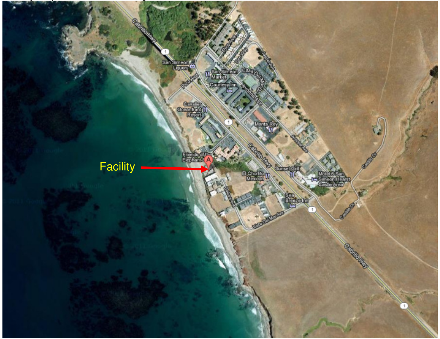
Facility Map B-2. Satellite Image