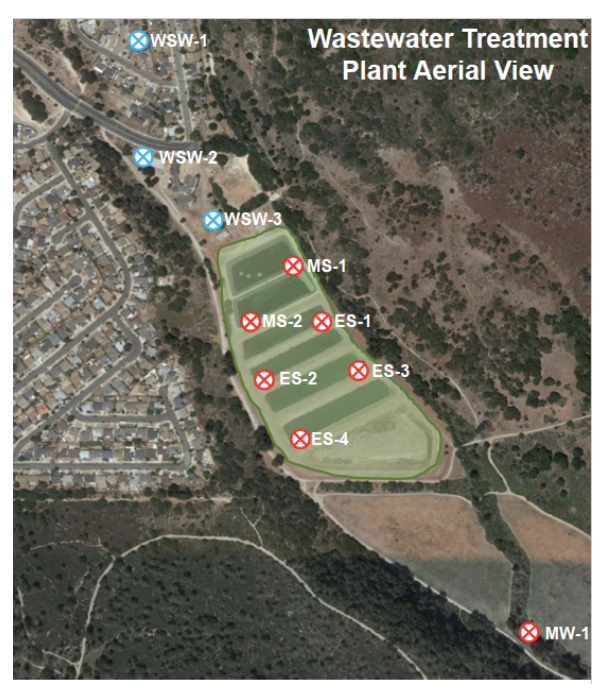
Figure B – Example aerial photograph of a Wastewater System. Location of water supply wells labeled with blue crosses. Location of monitoring well labeled with a red cross. Additional maps would be needed to show other system components.