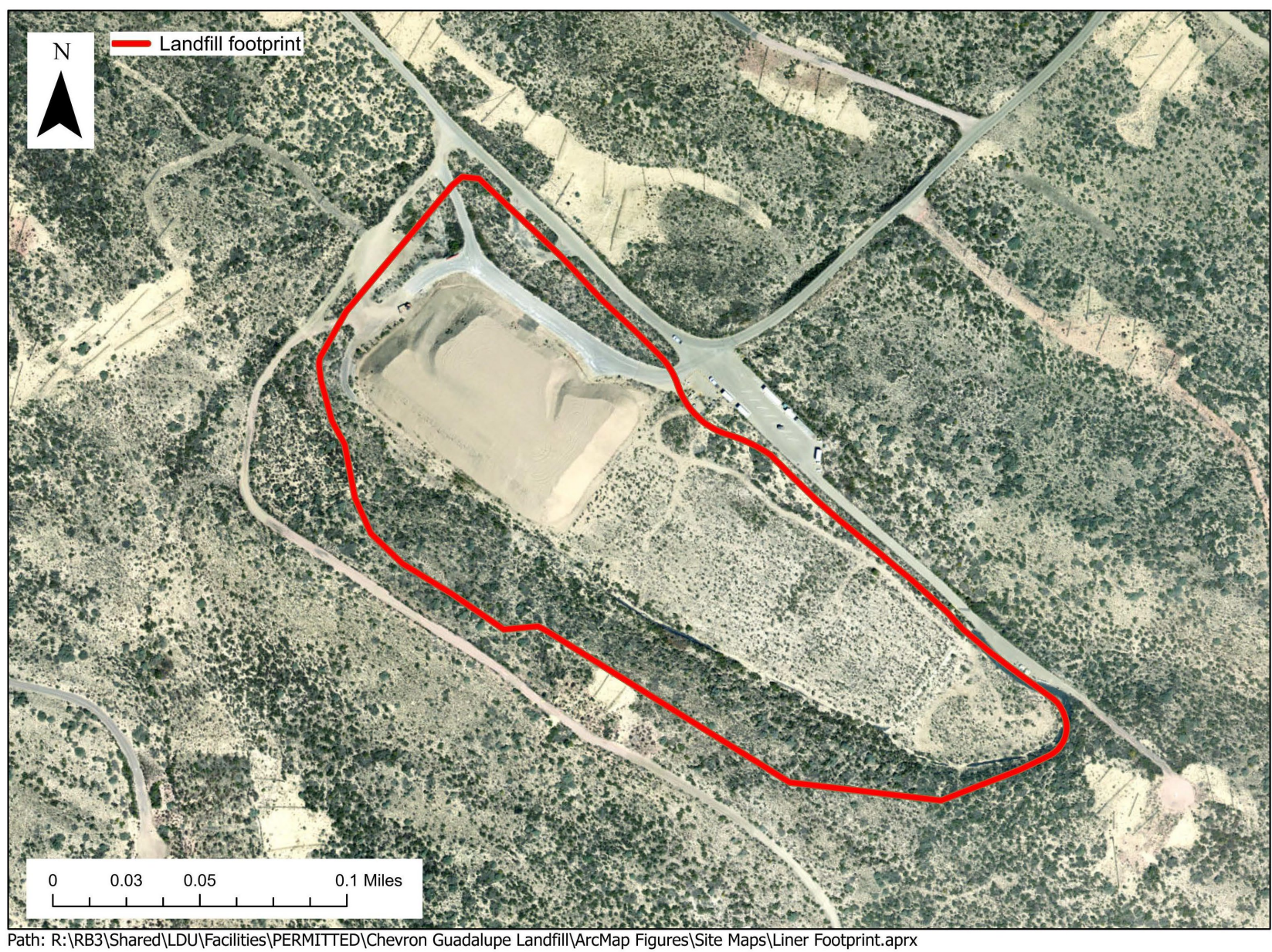
Figure 1-2: Landfill liner footprint