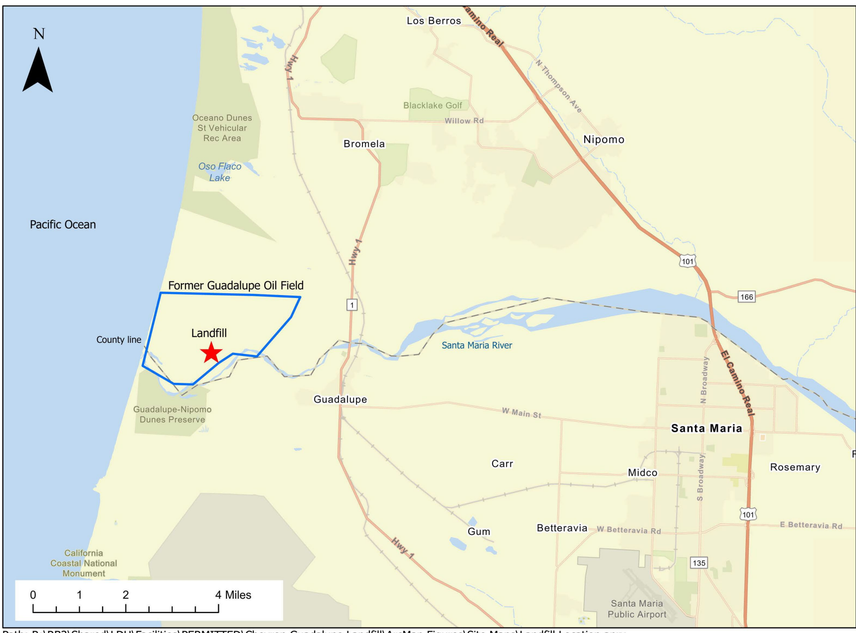
Figure 1-1: Landfill location within the former Guadalupe Oil Field

Path: R:\RB3\Shared\LDU\Facilities\PERMITTED\Chevron Guadalupe Landfill\ArcMap Figures\Site Maps\Landfill Location.aprx