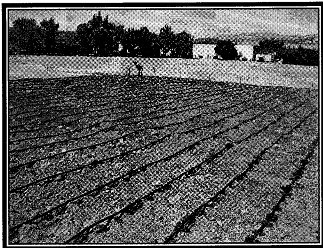
Figure 1 - Ex Situ soil pile with irrigation tubing installed and prior to installation of impermeable cover.

Olin has proposed to treat onsite perchlorate impacted soils using both ex situ and in situ methods. The two main components of the treatment option include: ex situ anaerobic bioremediation of perchlorate-contaminated