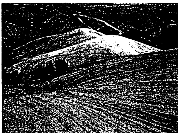
Photo 3 - Cleared hillside.