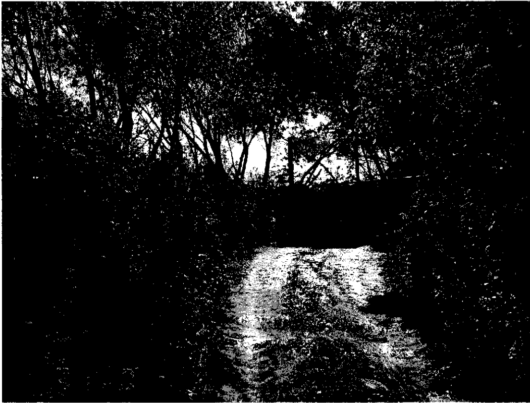
Figure 3: Gated access to disposal area (north from Davis Road)