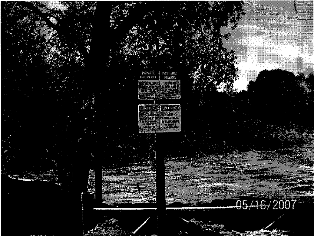
Figure 7: Signage at Discharger’s southern (HWY 68) access gate