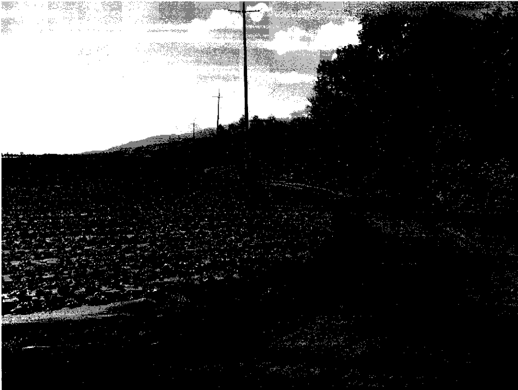
Figure 5: Agricultural service road from Davis Road leading up to disposal area beyond tree line on right