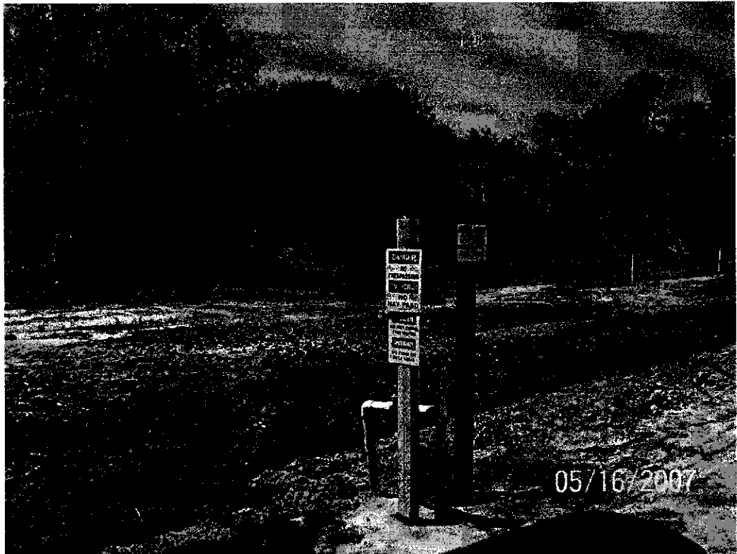
Figure 10: Signage at valve riser