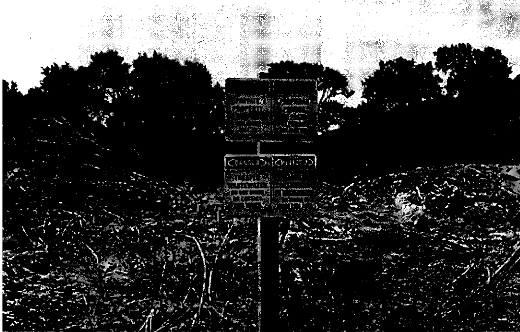
Figure 11: Close up of typical signage along agricultural service road

S:\WDR\WDR Facilities\Monterey Co\California Utilities Service\R3-2007-0008\Board update photo attach 070607.doc