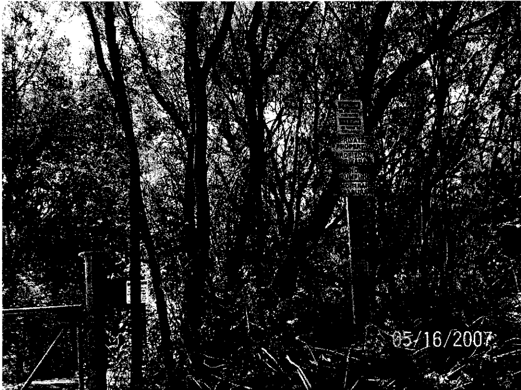
Figure 6: Signage at Discharger's gated access road along Davis Road