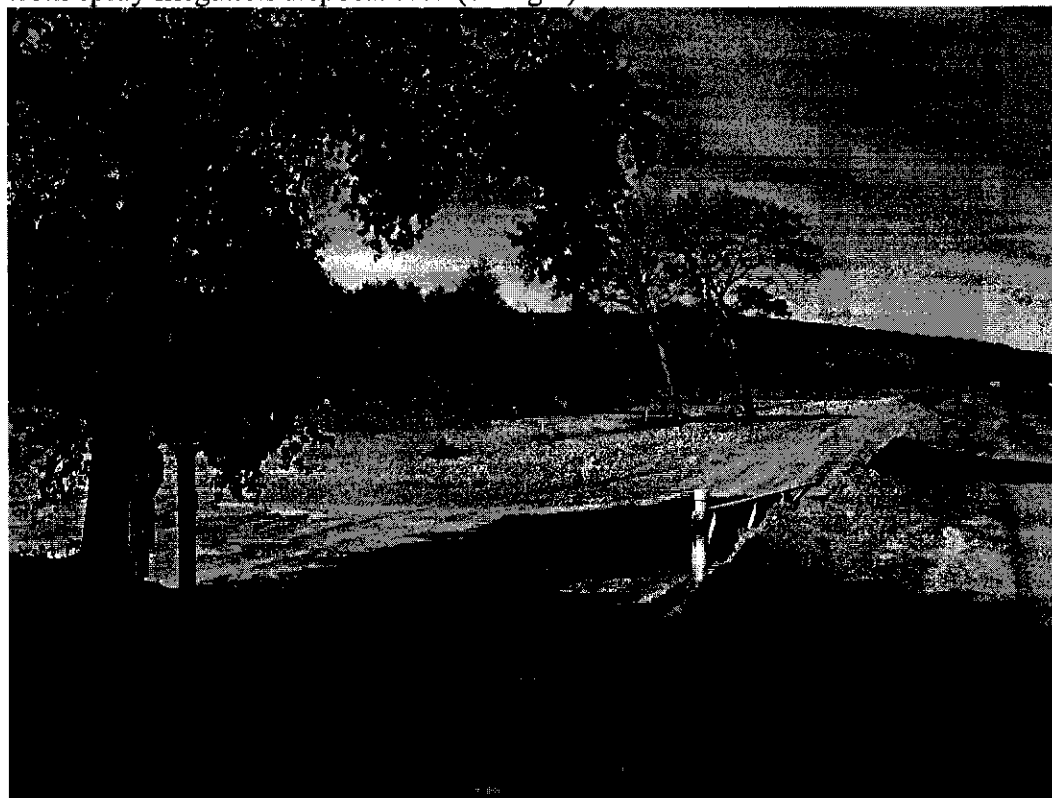
Figure 2: Gated access to disposal area (south from HWY 68); service roads and berm/embankment separating disposal area from agricultural fields (on right)