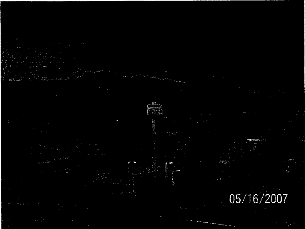
Figure 9: Signage at valve junction and riser