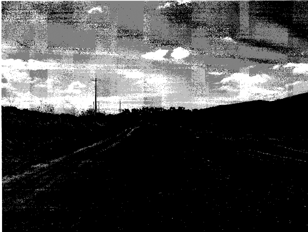
Figure 1: Berm/embankment and service road (on left) separating agricultural field (not seen) from spray irrigation disposal area (on right)