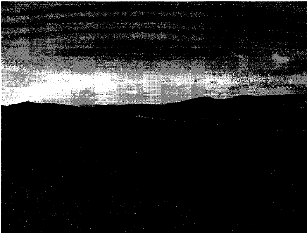
Figure 4: Agricultural service road (on right) from HWY 68 leading up to disposal area in the distance