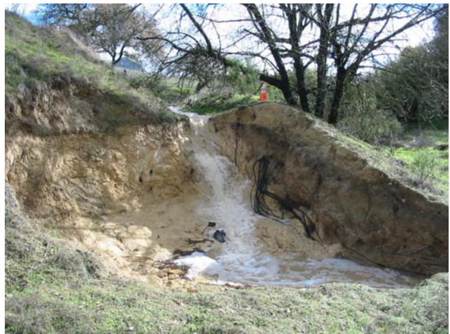
December 2002 – Uncontrolled runoff from construction site causes large scale erosion, continuing to fill in pond and riparian area.