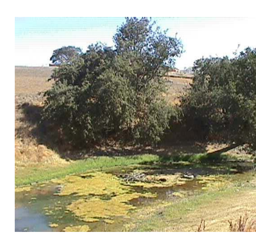
October 2002 – Pond in natural drainage was filling in from erosion caused by drainage overflow and sediment from construction site upstream. Pond and riparian area (not shown) contained construction debris, which demonstrated the source of the sediment and fill material.

One of my most memorable and tangible success stories during my career with the Water Board occurred early in my tenure in the Stormwater During my construction site section. inspections, I found a Paso Robles construction project which was allowing large amounts of eroded sediment to leave the site. The site is situated at the head of one of the many unnamed tributaries to the Salinas River. I walked the length of the tributary from the construction site down, and found that a moderate sized pond had been filled straw with sediment. bales. and debris construction from the construction site. The pond was situated within native oak habitat, and showed remnants of now-buried wetland and riparian plants along the edges of the pond. I pressed for the construction site owner to improve his on-site construction erosion/sedimentation practices, and to remove debris and sediment from the pond. The pond recovered from the inundation, and I have the pleasure of glimpsing the water-filled aquatic habitat nestled in the oak forest whenever I travel Highway 46E. I have satisfaction knowing that I took the time to follow the tributary from the construction site origin, document the full impact the sediment had on the aquatic and riparian zone, and pressed for full mitigation on- and off-site. This resulted in gaining back and protecting a gem of native habitat.