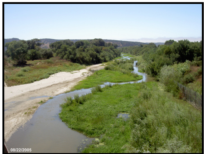
Salinas River at Spreckles

Staff contact: Pete Osmolovsky Central Coast Water Board Watershed Assessment Unit (805) 549-3699 paosmolovsky@waterboards.ca.gov