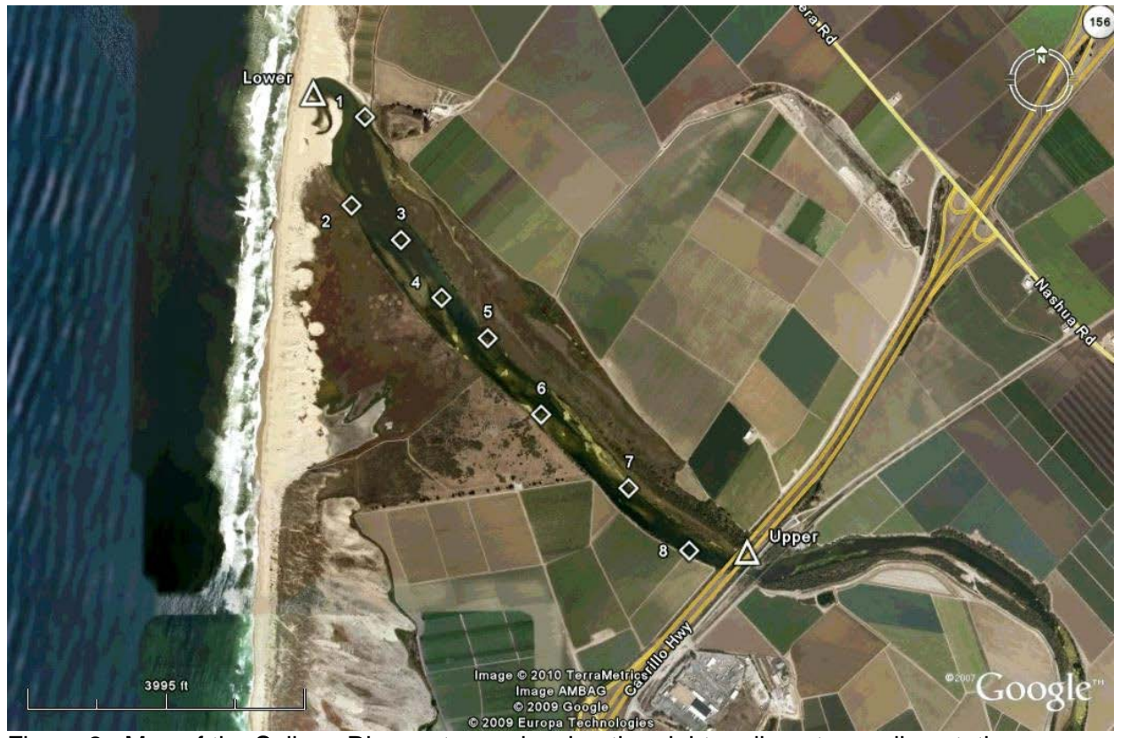
Figure 2. Map of the Salinas River estuary showing the eight sediment sampling stations (diamonds 1-8) and the five benthic community sampling stations (diamonds 1-5). The upper and lower estuary water toxicity and chemistry stations are depicted with triangles.

Notes: Mean percent survival (standard deviation) and organic carbon-corrected toxic unit (TU) sums for Salinas River sediment tests. The chemicals driving the sum TU are listed for sum TU > 0.1