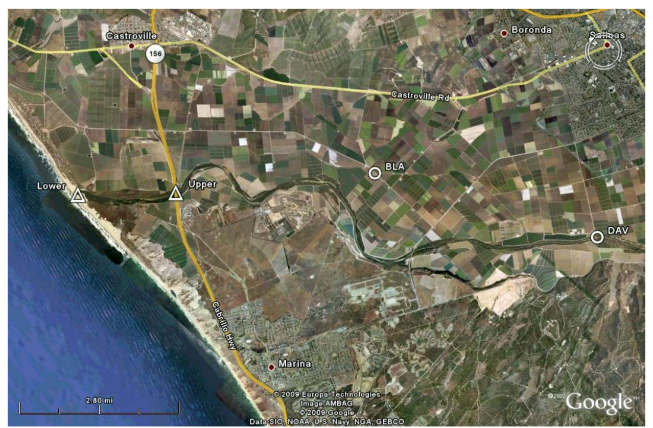
Figure 3. Map of the two Salinas River tributary stations (circles), Blanco Drain at Cooper Road (BLA) and the Salinas River at Davis Road (DAV).

Trends in Chemical Contamination, Toxicity and Land Use in California Watersheds: Stream Pollution Trends (SPoT) Monitoring Program Third Report - Five-Year Trends 2008-2012 (Phillips et al., 2014)