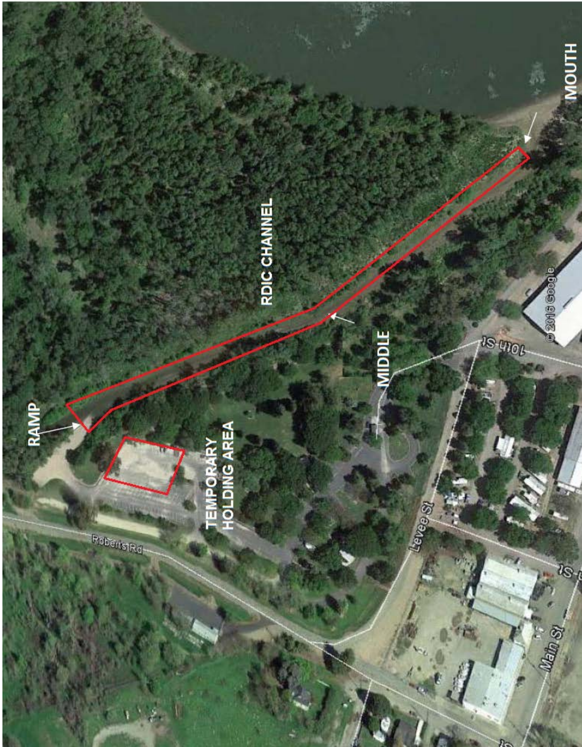
Figure 2- Site Map: Channel and Temporary Holding Area