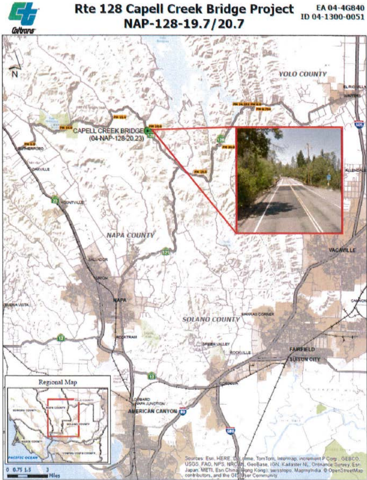
FIGURE 1 Project Vicinity and Location Map