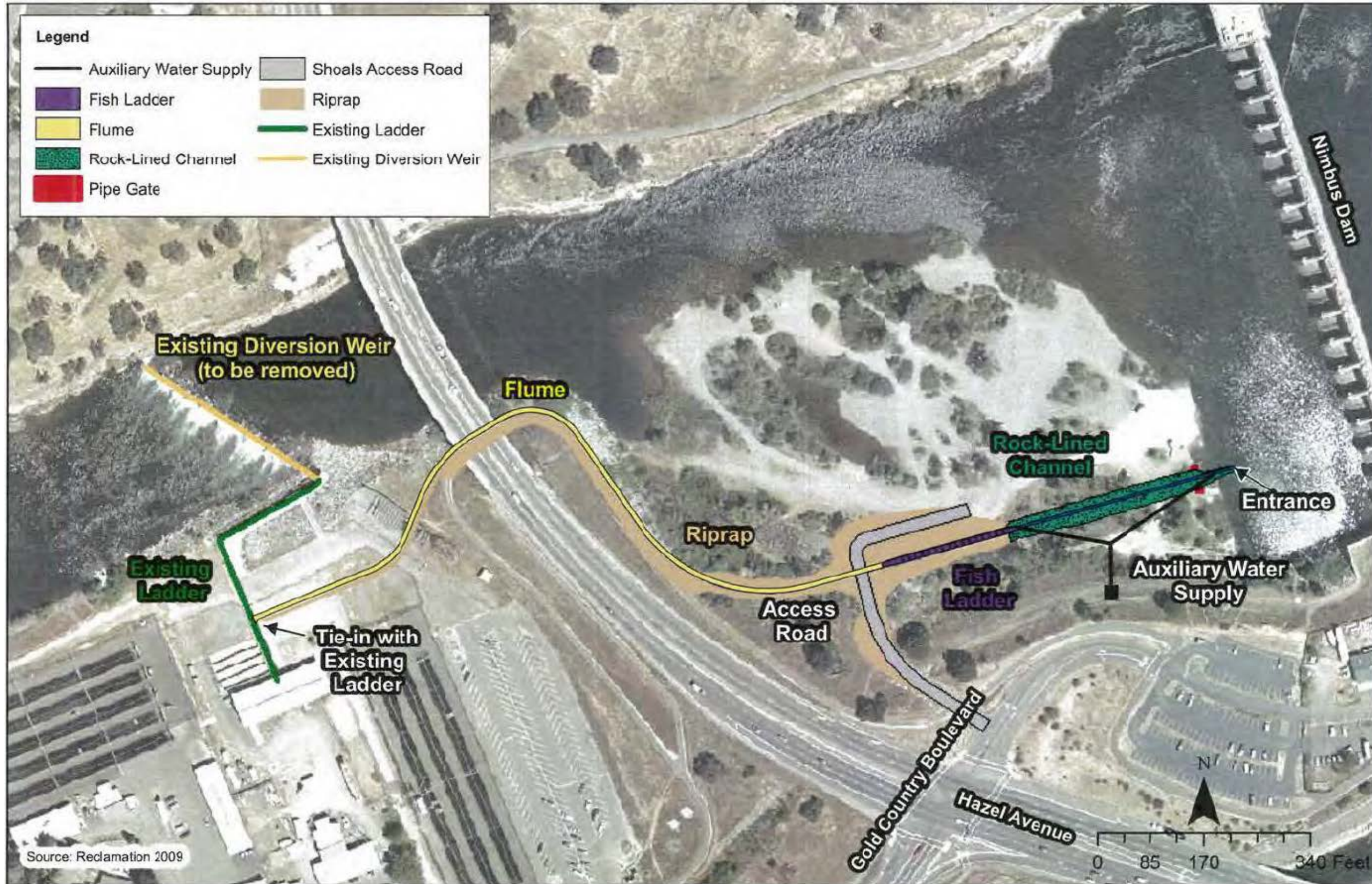
Figure 2 – Site Map