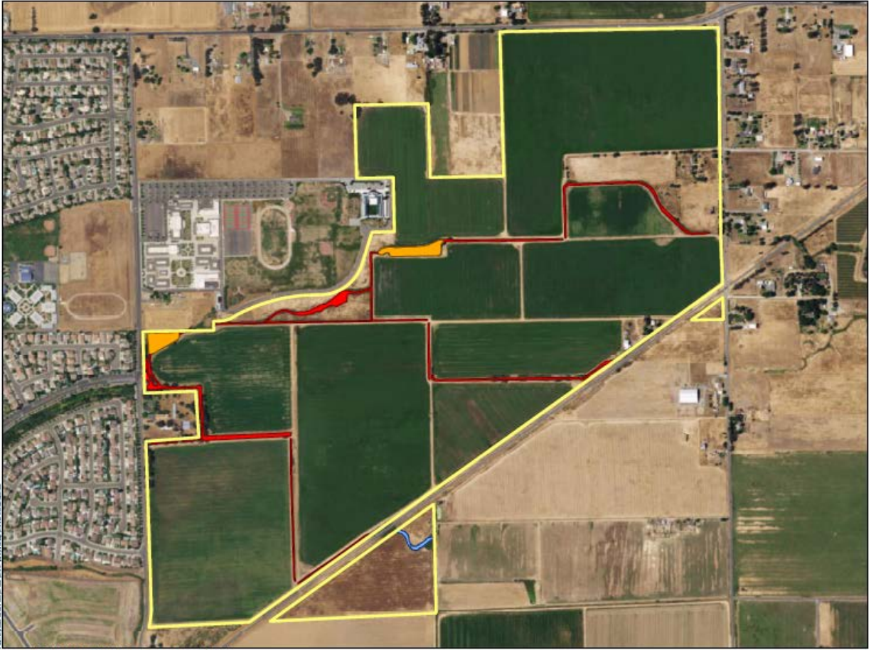
Source: USDA NAIP 2010; Aerial; WPA 1 Prepared By: mitchell, 10/23/2017