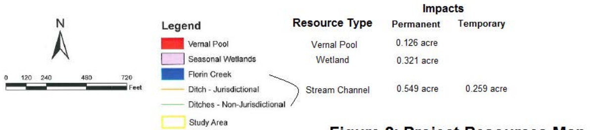
Figure 2: Project Resources Map