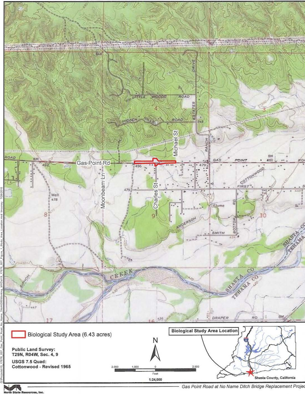
Figure 1 Study Area Location