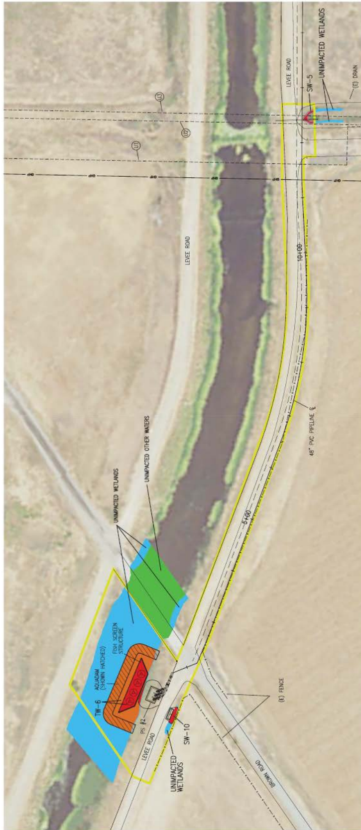
PLAN VIEW - IMPACTS TO WATERS OF THE UNITED STATES