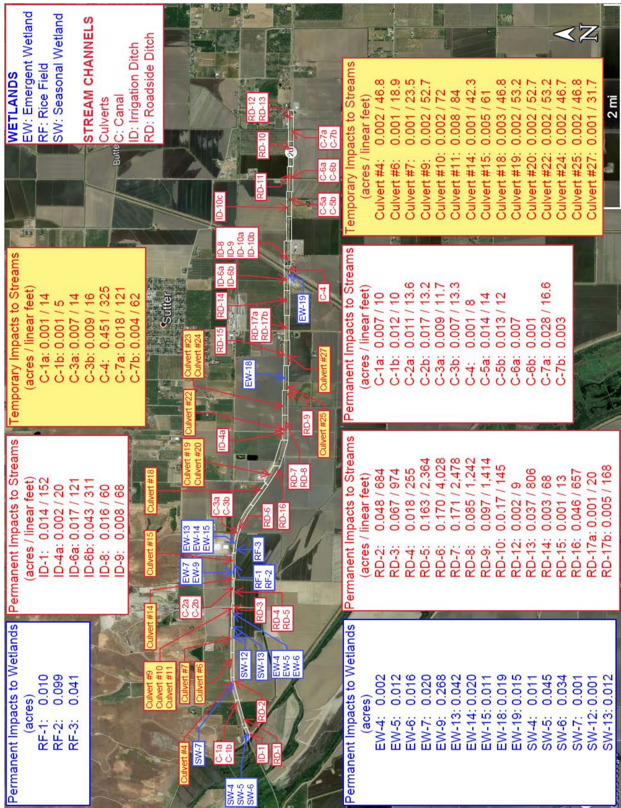
Figure 2: Project Impacts Map