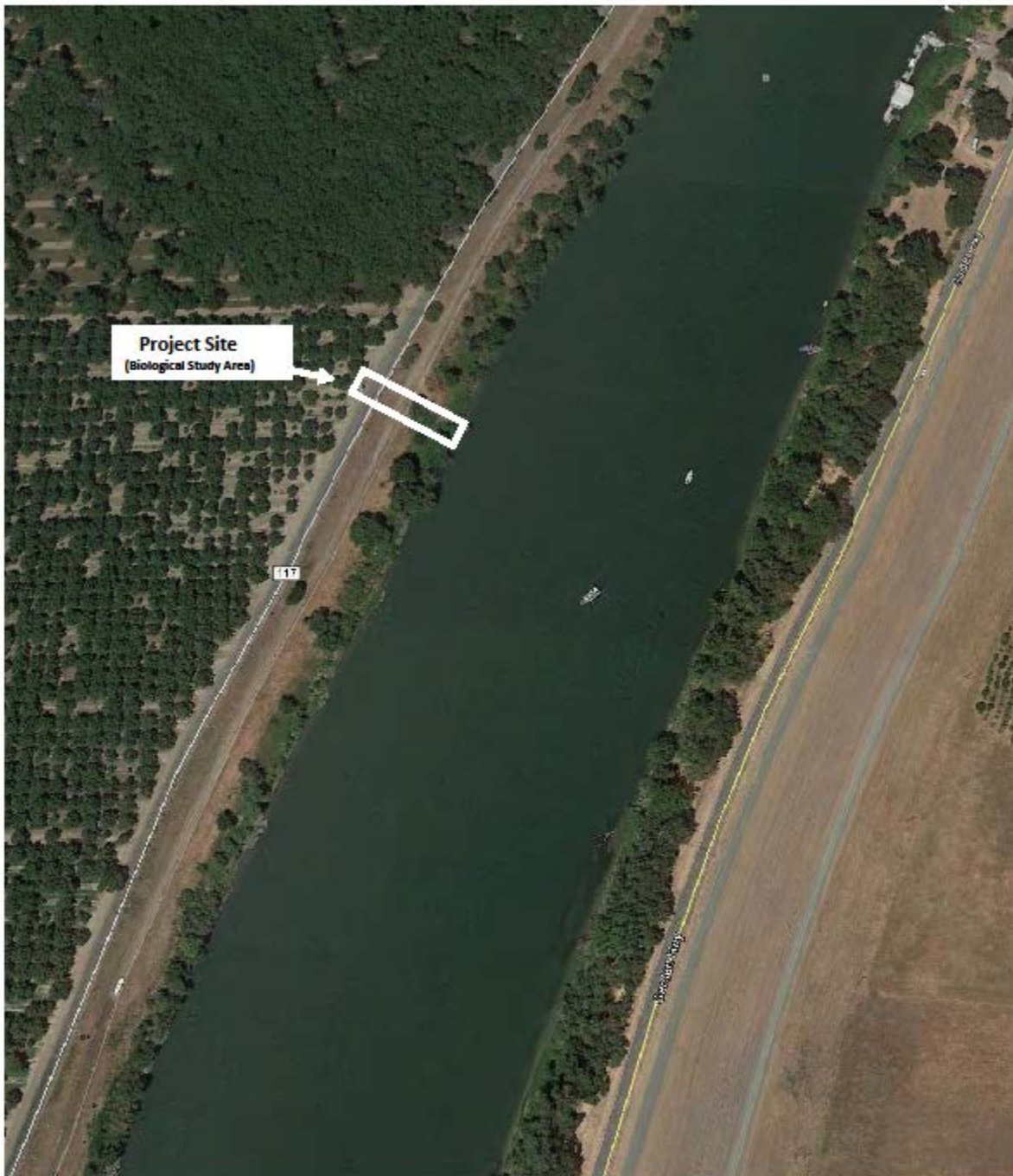
Figure 2: Aerial Map, Bypass Farms Pipe Replacement Project Site located within Section 2, Township 10 North, Range 3 East, Taylor Monument USGS Quad, approximately 38.7435 North, -121.6013 West. Site is located at River Mile 76±, Yolo County, California.