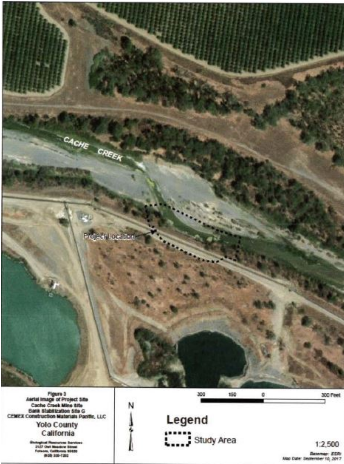
Figure 2 – Project Site Map (a)