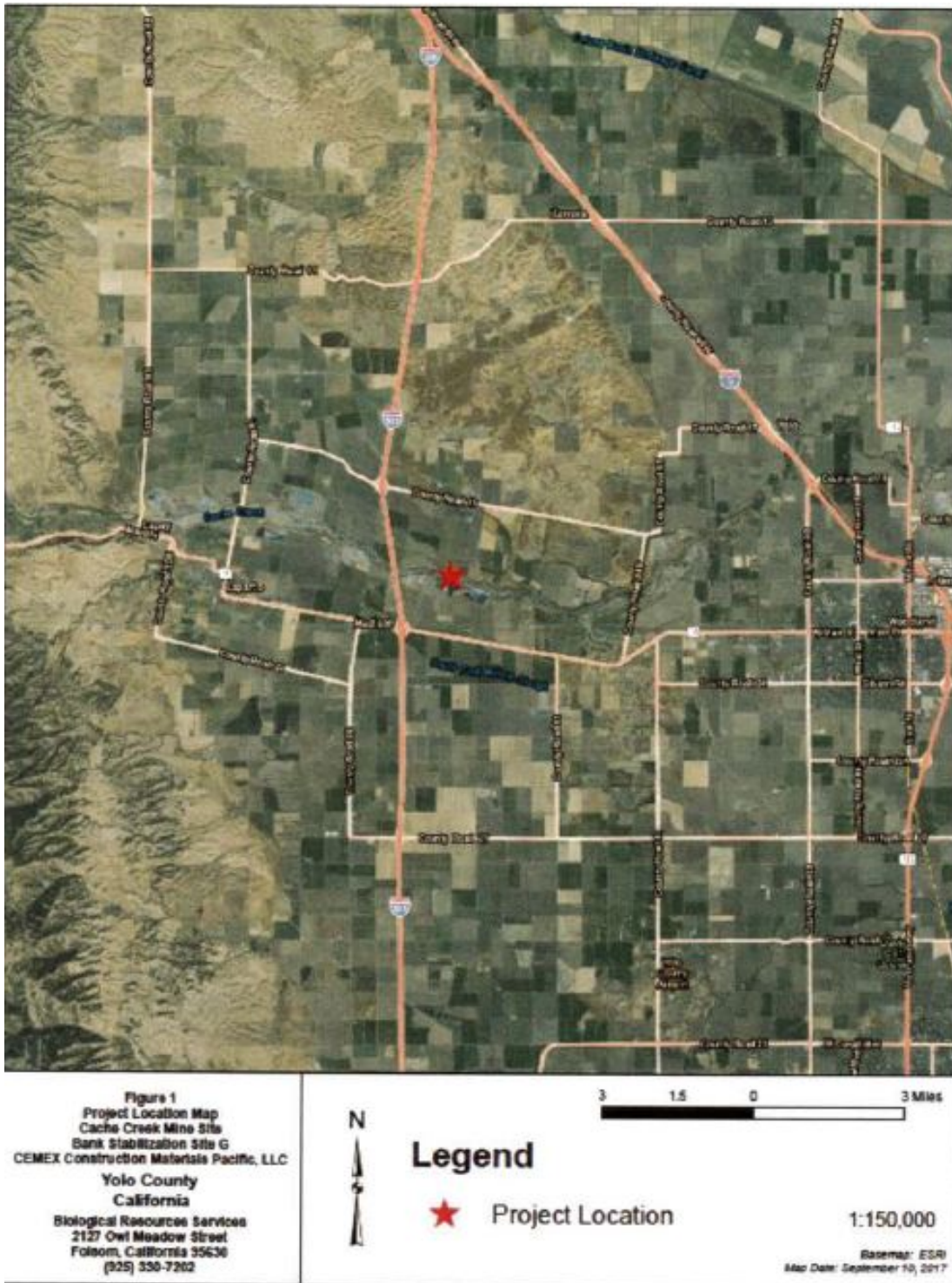
Figure 1 – Project Location Map