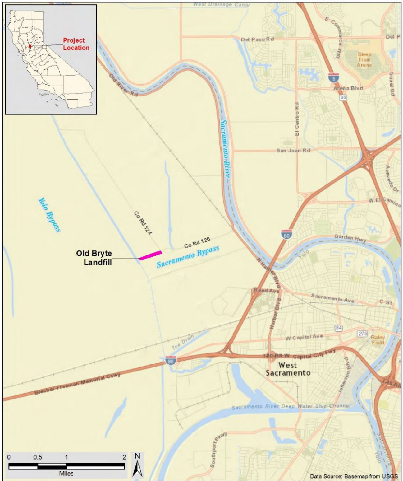
Figure 1 – Project Location Map