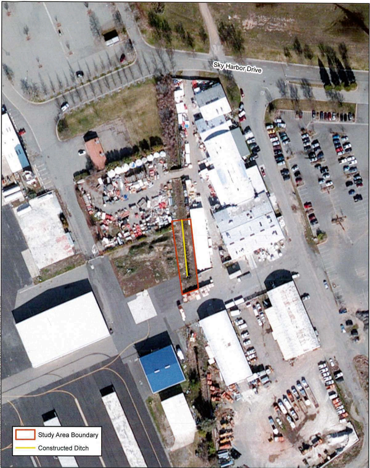
Figure 2 Study Area