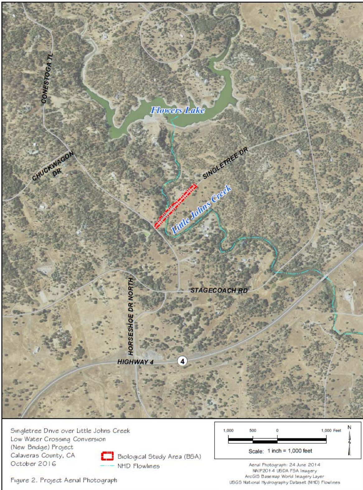
Figure 2 – Site Map