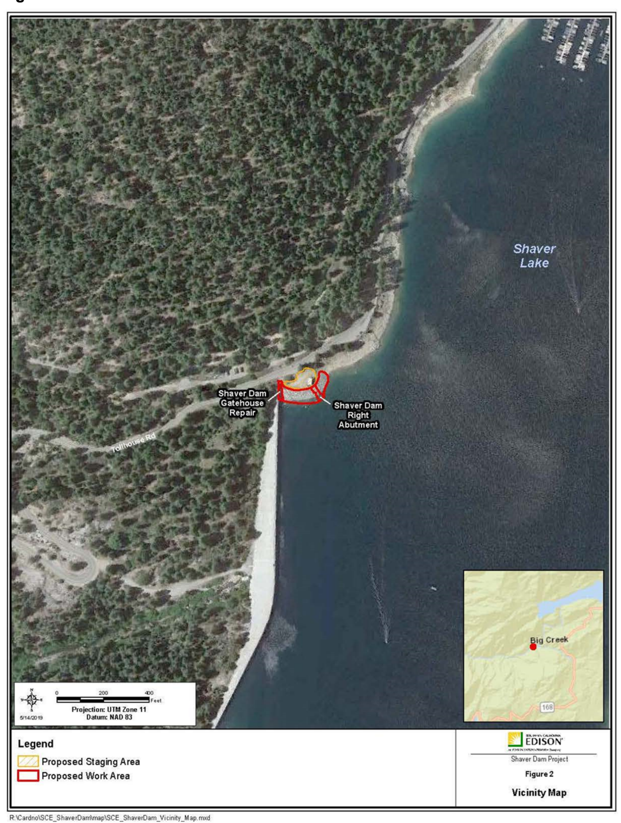
Figure 2- Work Area