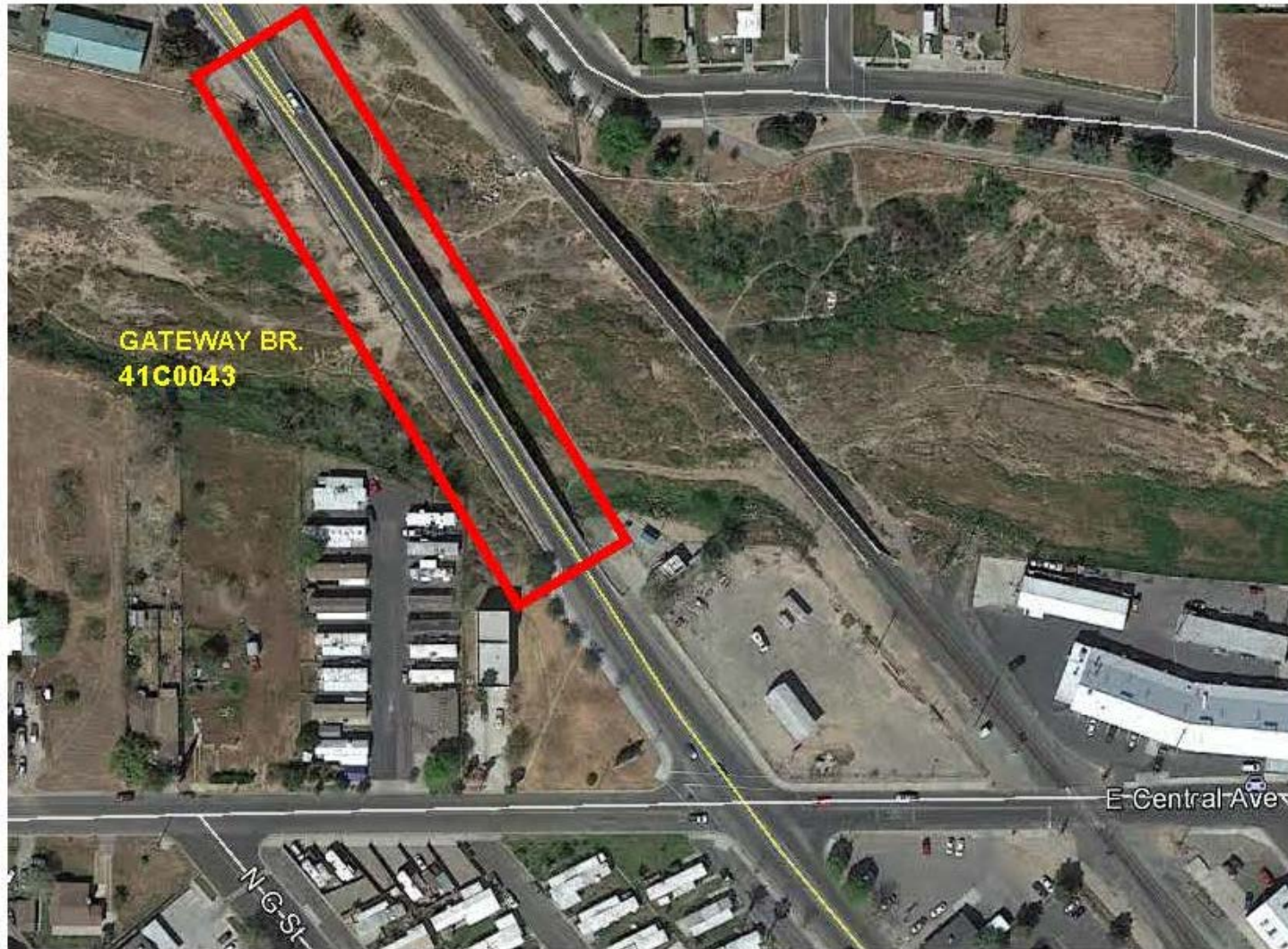
Figure 2- Impact Area- Gateway Avenue