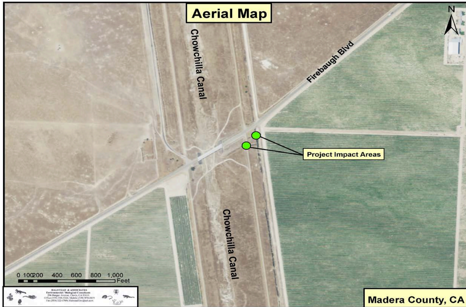
Figure 2- Impact Area