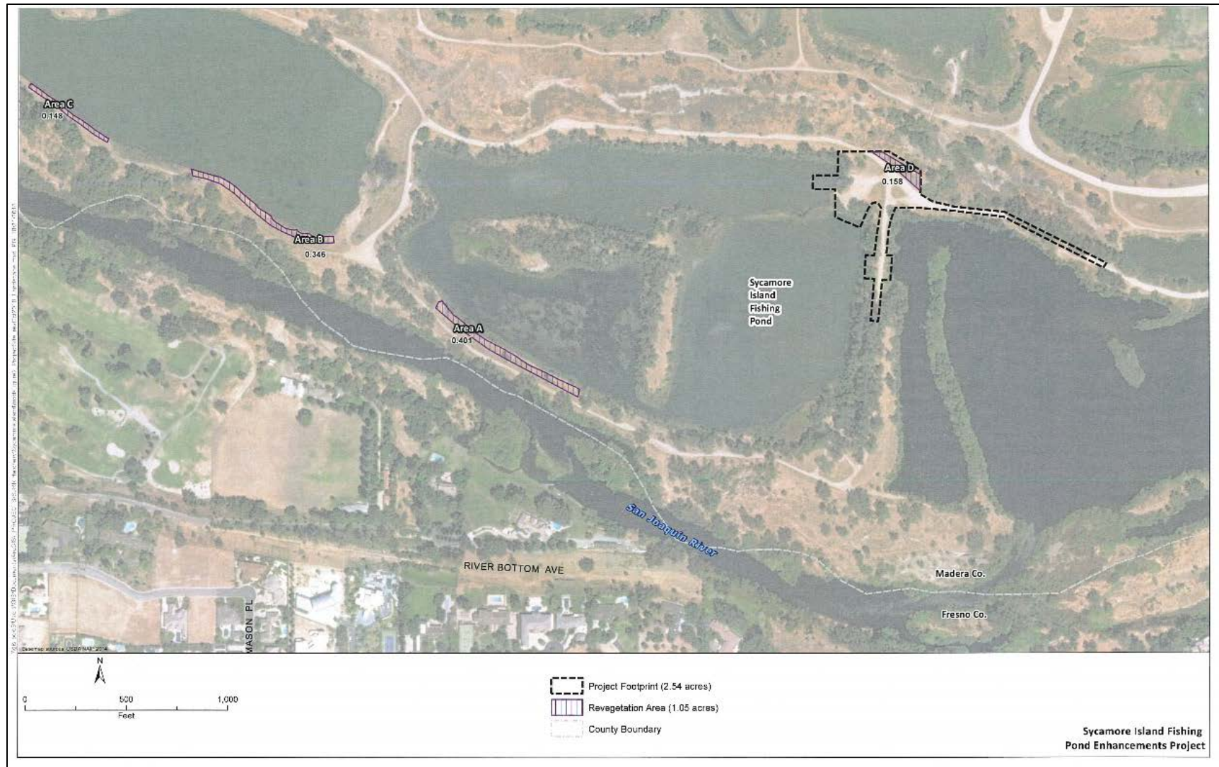
Figure 2- Project Vicinity Map