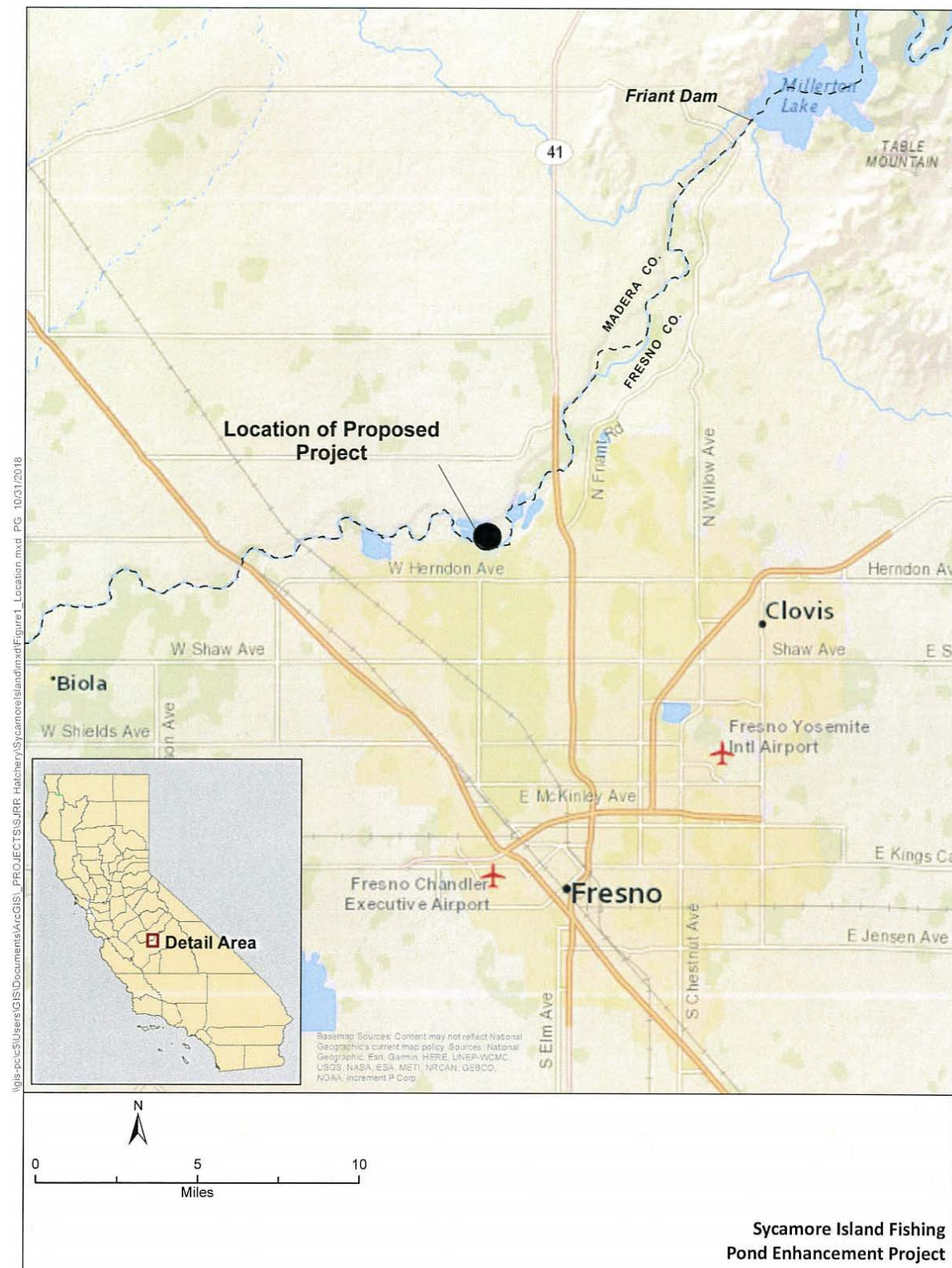
Figure 1- Location Map