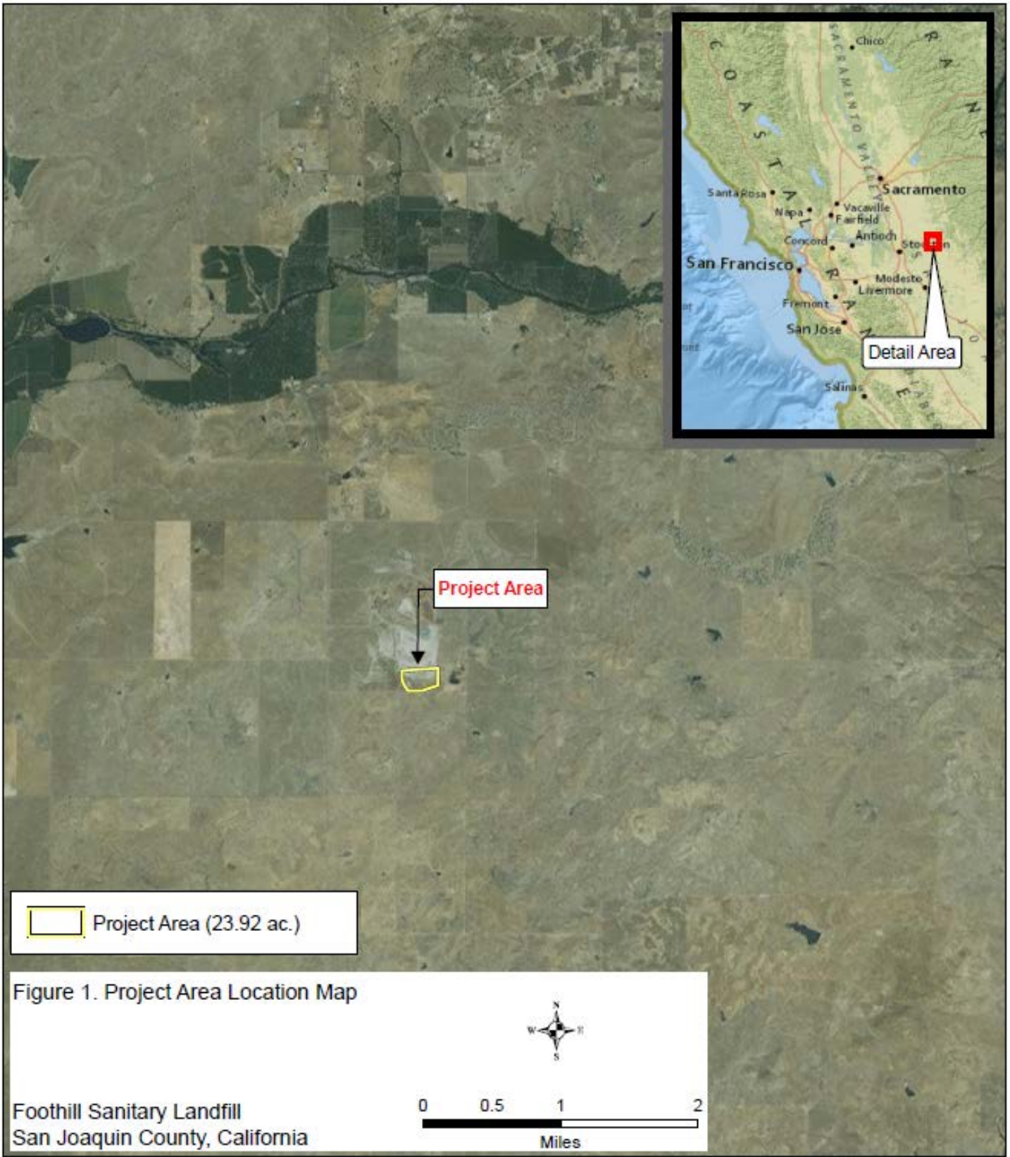
Figure 1. Project Area Location Map

Foothill Sanitary Landfill San Joaquin County, California