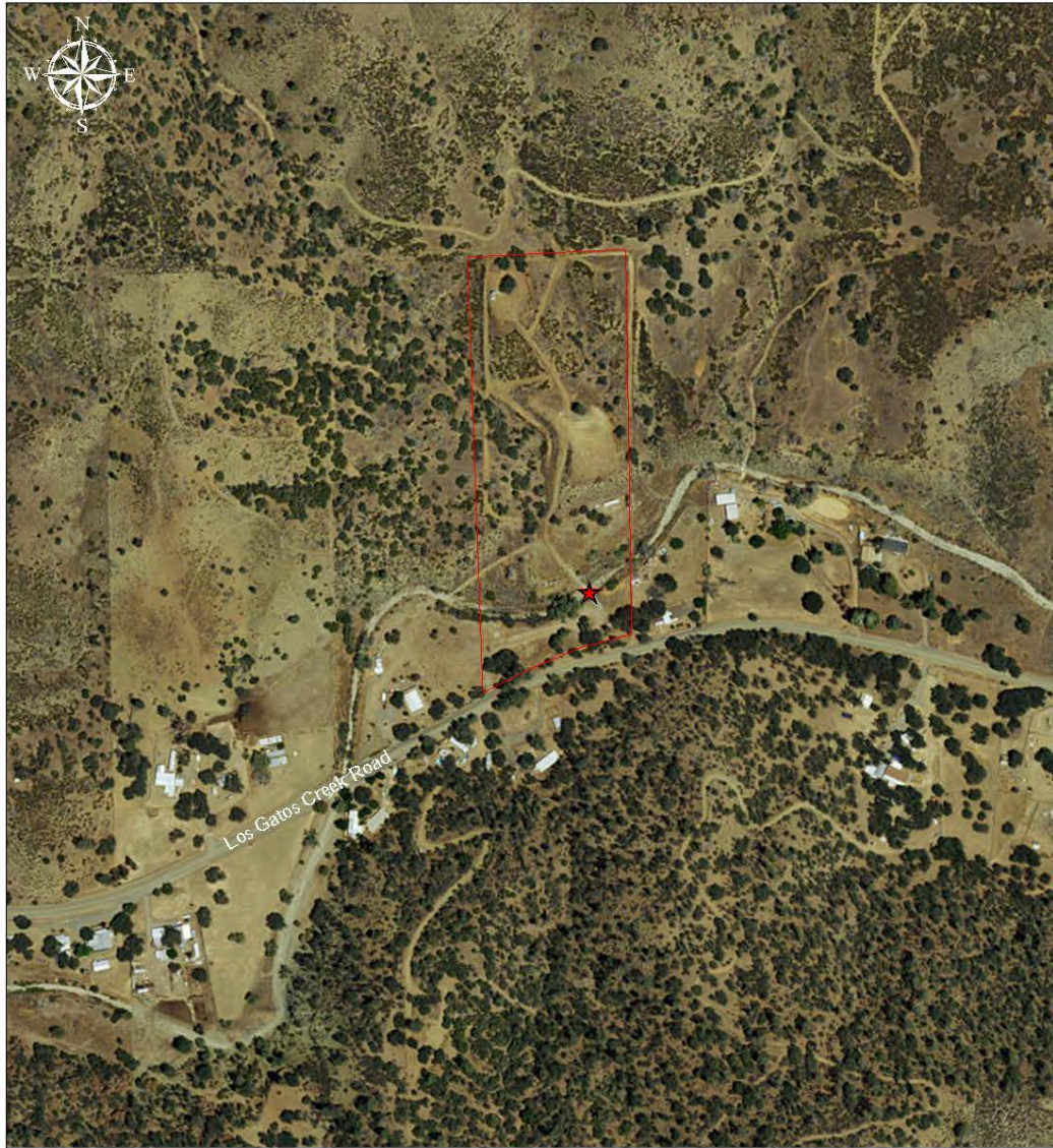
Figure 1. Aerial Photograph

★ Project Location □ APN 063-280-11S Boundary