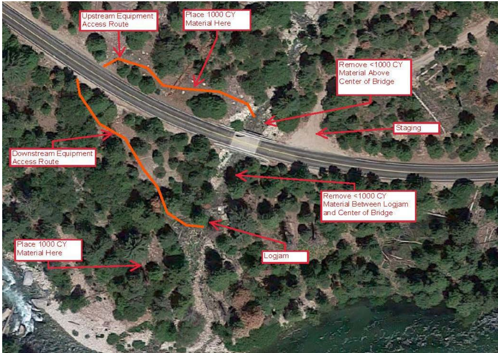
Figure 2- Site Map