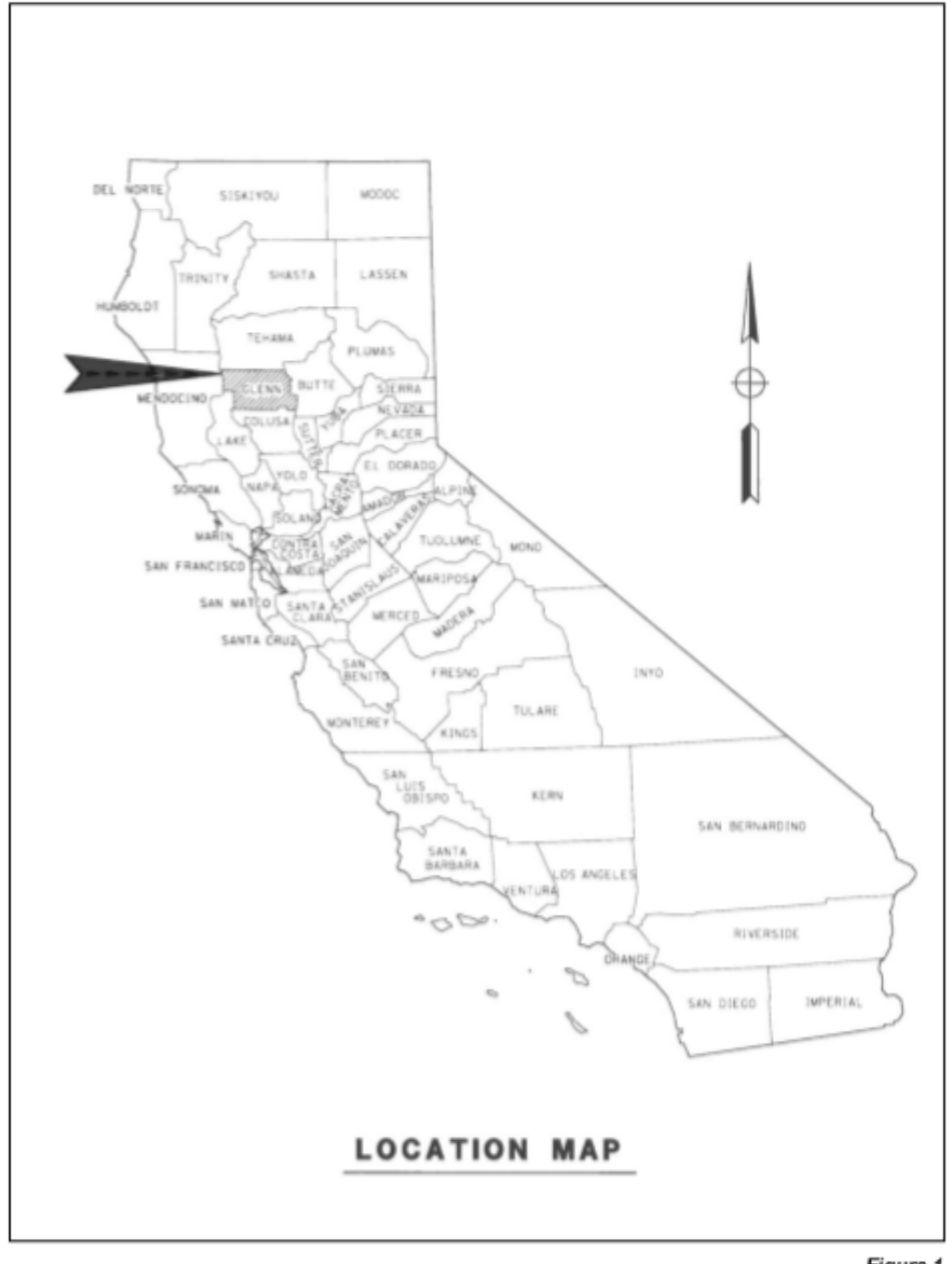
Figure 1 Regional Location Map

County of Glenn - Walker Creek Bridge Replacement Project Initial Study Initial Study/Mitigated Negative Declaration