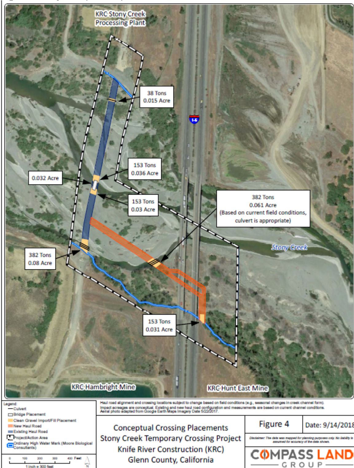
Figure 3: Project impact map