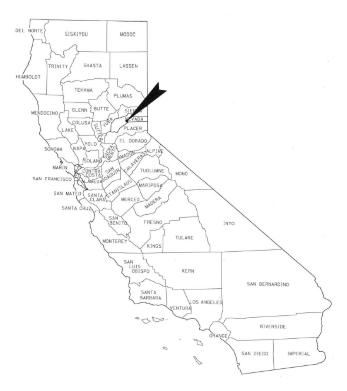
Figure 1 – Project Location Map