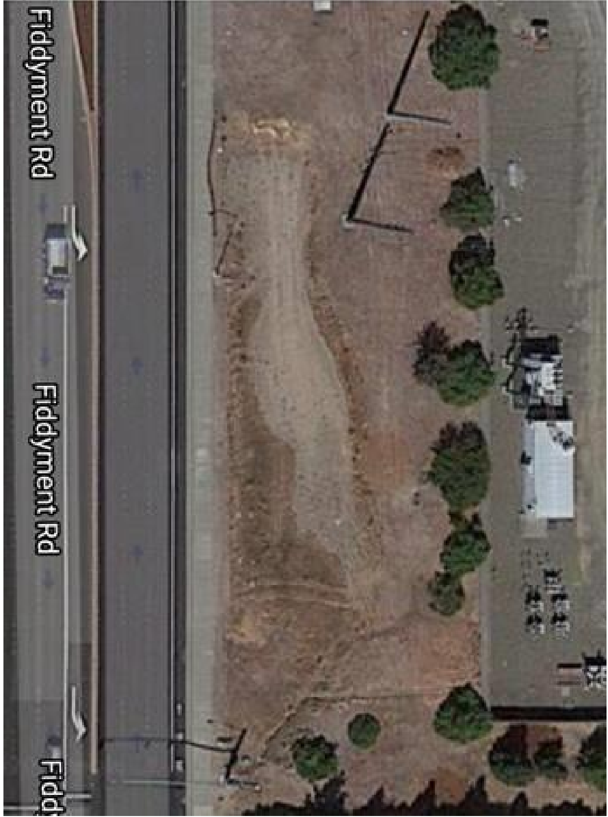
Figure 2 – Project Site Map